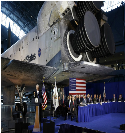
Vice President Mike Pence speaks at the sixth meeting of the National Space Council at the National Air and Space Museum in Chantilly, Virginia, August 20, 2019.

The announcement was anticipated in the space community, since Vice President Mike Pence told the National Space