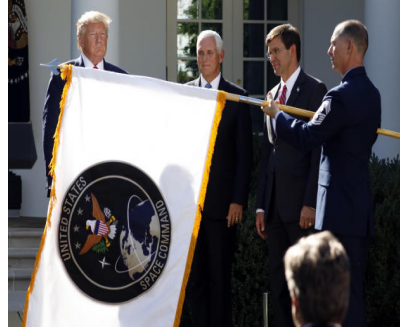
President Trump watches with Vice President Pence and Defense Secretary Mark Esper as the flag for U.S. Space Command is unfurled in the Rose Garden of the White House in Washington, DC, Thursday, Aug. 29, 2019.

With the United States Space Command being officially announced, President Trump added that before long, the U.S. will establish a sixth branch of the military, The U.S. Space Force, for space defense.