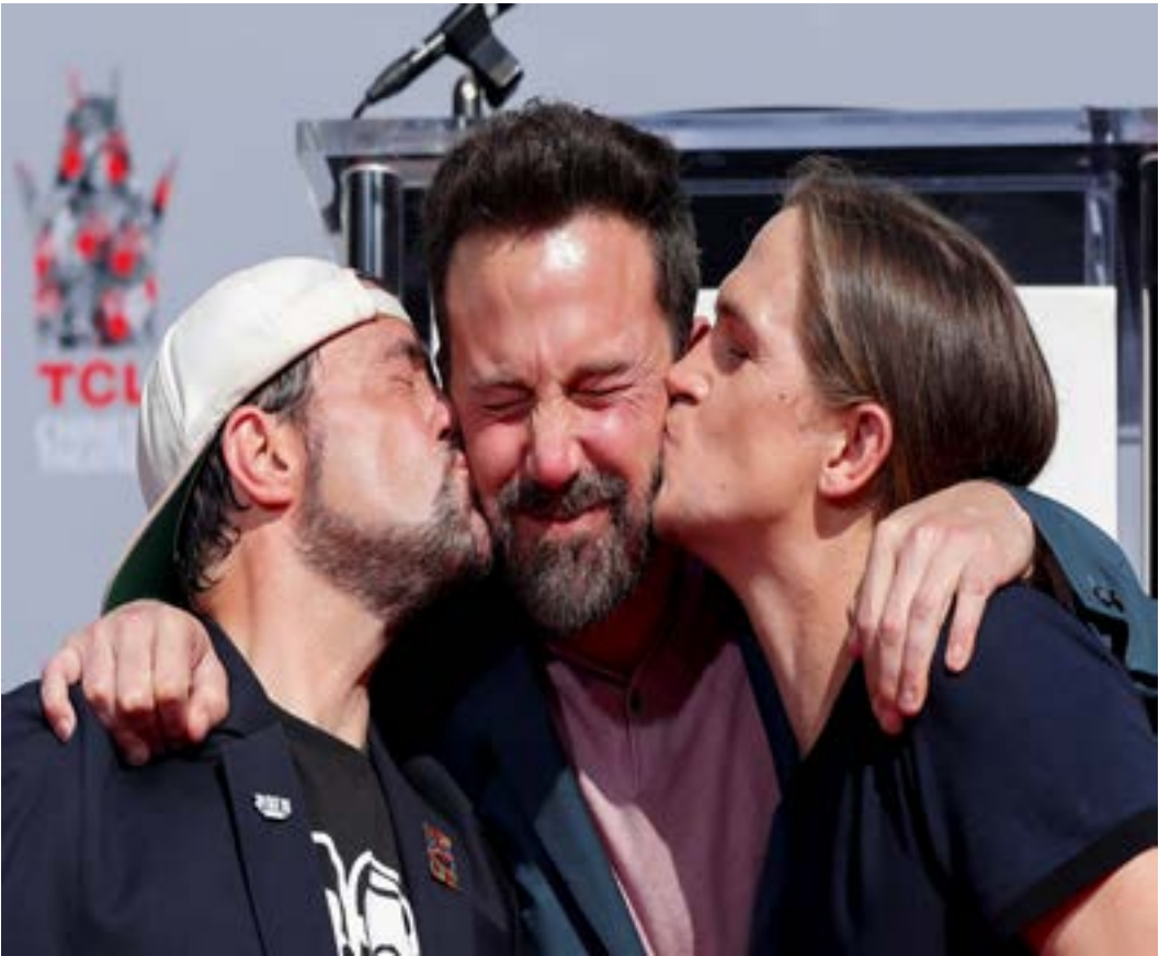
Kevin Smith and Jason Mewes place their handprints and footprints in cement in Los Angeles