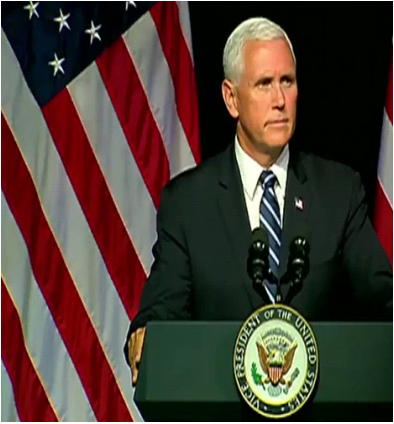
U.S. Vice President Mike Pence Tweet from Vice President Mike Pence Vice President Mike Pence @VP

The next generation of Americans to confront the emerging threats in the boundless expanse of space will be wearing the uniform of the United States of America. 10:58 AM - Aug 9, 2018 4,454