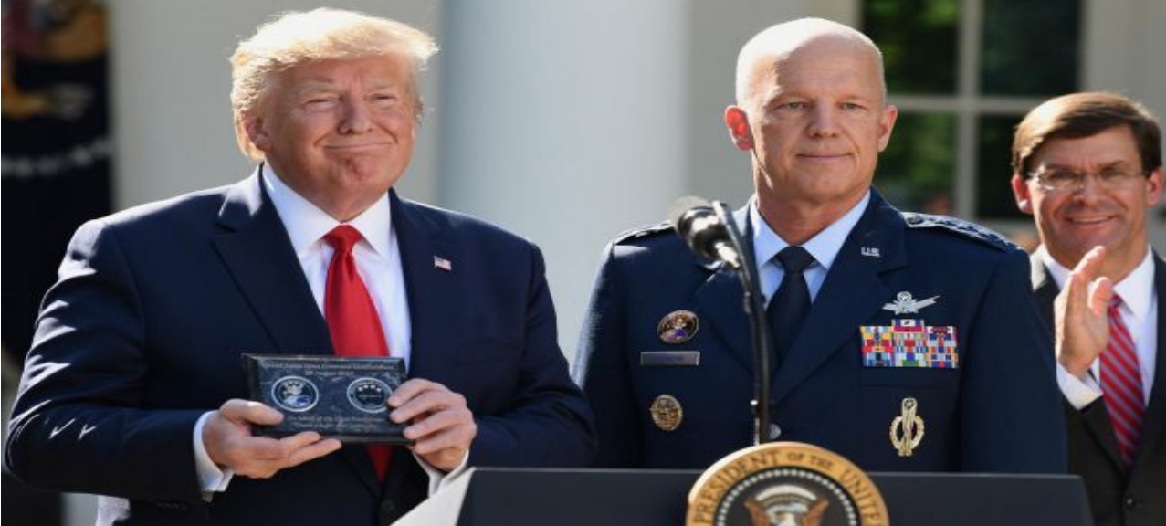
President Donald Trump and U.S. General John W. Raymond mark the formal establishment of the U.S. Space Command on Aug. 29, 2019.