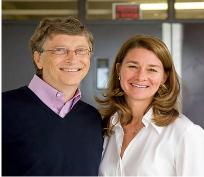
Bill and Melinda Gates

ey made on investments), which would disproportionately affect the wealthy. None of the richest people in the world have made their fortunes solely through a salaried job, and for that reason Gates believes the government “should shift more of the tax burden onto capital” rather than labor. “I don’t see any reason to favor wealth over work the way we do today,” he wrote. It’s “the clearest evidence I’ve seen that the system isn’t fair,” he said. Gates also said in Tuesday’s blog post that the U.S. should have a higher estate tax, which would affect the rich.