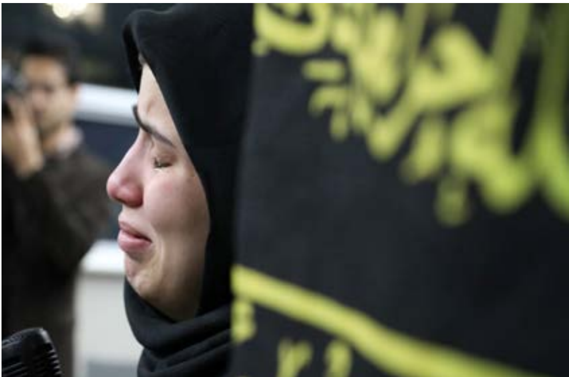
Mourners attend a vigil at University of Toronto student housing for the victims of a Ukrainian passenger jet which crashed in Iran