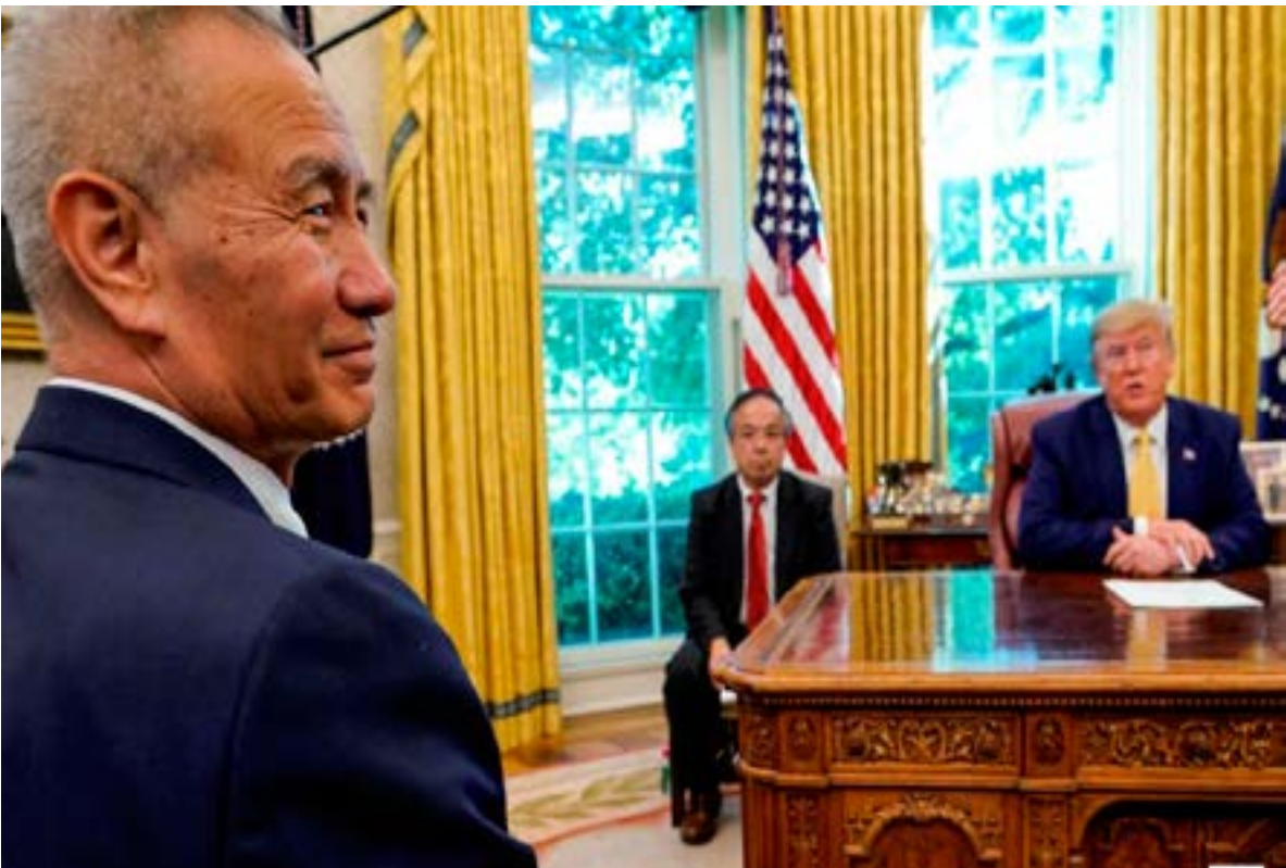
FILE PHOTO: China's Vice Premier Liu He looks on during a meeting with U.S. President Donald Trump in the Oval Office of the White House in Washington, U.S., October 11, 2019.

China's import needs have already been covered through the first quarter of the year, the traders said on condition of anonymity. "The key factor for crushers is whether the beans are cheap, even with a trade deal. If the beans from South America are cheap, buyers will go for South America," one of the traders said.