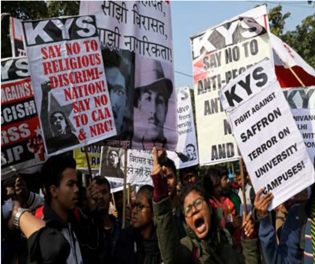
Protest against attacks on students of Jawaharlal Nehru University, in New Delhi