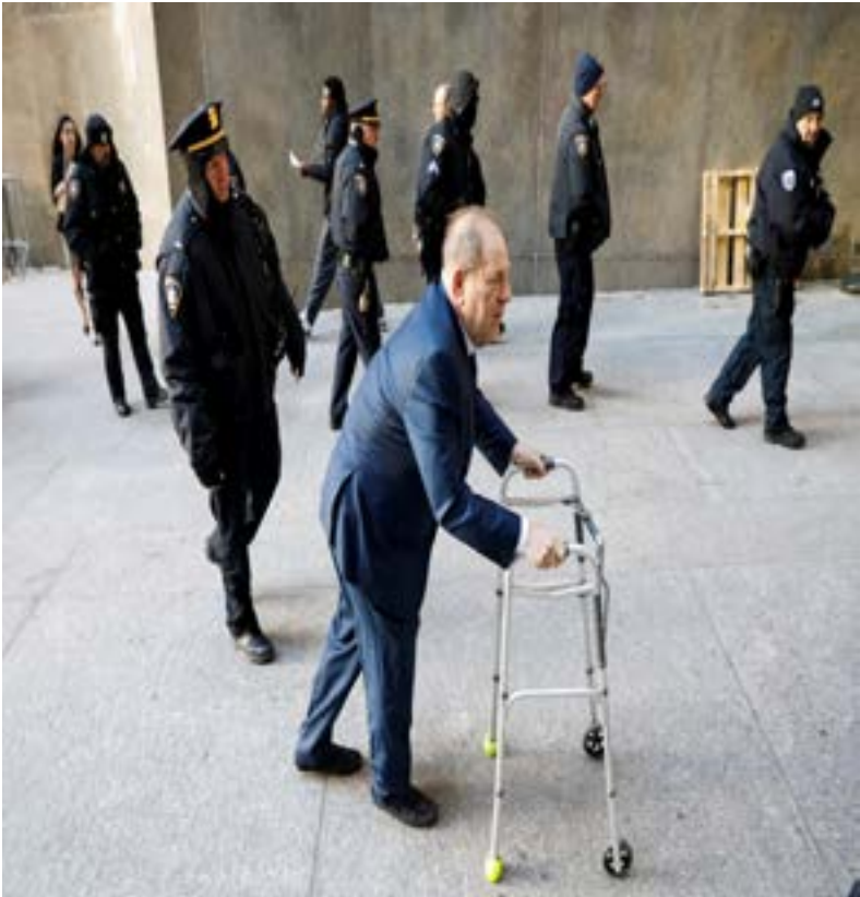
Film producer Harvey Weinstein arrives at New York Criminal Court for his sexual assault trial in New York