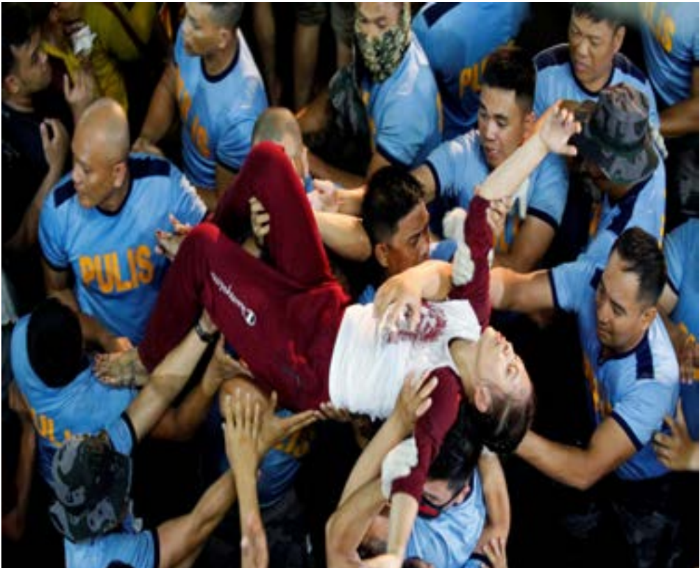
A Filipino devotee is carried by police officers outside the Quiapo church after she fainted during the Black Nazarene feast day in Manila, Philippines, January 9, 2020. REUTERS/Willy Kurniawan TPX IMAGES OF THE DAY