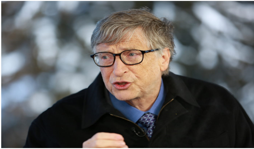
Bill Gates speaking at the 2019 WEF in Davos, Switzerland on Jan. 23rd, 2019.