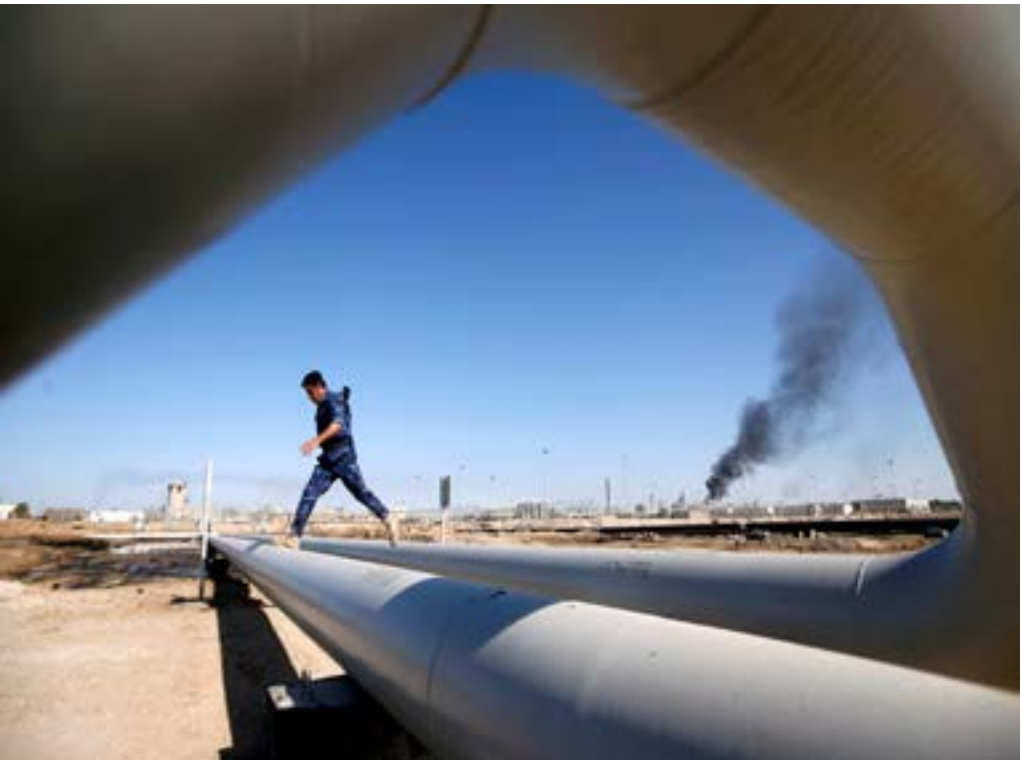
A policeman walks at West Qurna-1 oil field, which is operated by ExxonMobil, in Basra