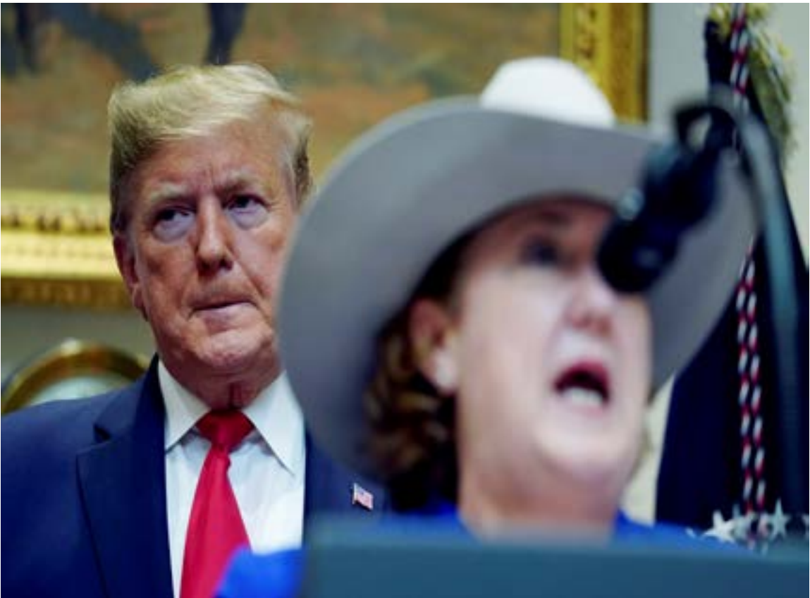
U.S. President Trump announces proposed changes to environmental regulations at the White House in Washington