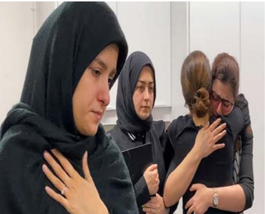
Mourners attend a vigil at University of Toronto student housing for the victims of a Ukrainian passenger jet which crashed in Iran