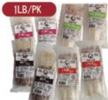
PORK/BEEF/CHICKEN VARIO 豬肉/牛肉/雞肉串