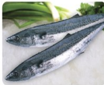
FRESH SIERRA 新鮮小馬鮫