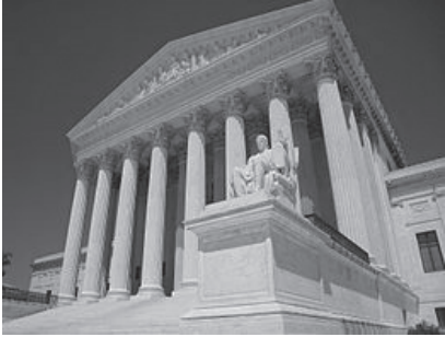
U.S. Supreme Court Building in Washington, D.C

WASHINGTON — The Supreme Court agreed Friday to decide if states should be able to collect taxes on internet sales, which would generate billions in revenue for local governments, but also raise the cost of online shopping for consumers. Just over a quarter-century ago, the court ruled that a state could not force mail order catalog companies to collect sales taxes unless they had a physical presence in the state. Led by South Dakota, 36 states want the court to take another look at the issue, arguing that the 1992 decision was issued “before Amazon was even selling books out of Jeff Bezos’s garage.” Part of the court’s logic was that it would be too difficult for mail order companies to compute the widely varying tax rates among, and even within, the 50 states. But lawyers for South Dakota said that’s no longer an issue in the digital age. “Advances in computing have made it easy for retailers to collect different states’ sales taxes,” they wrote in a court brief. Internet companies “can instantly tailor their marketing and overnight delivery of hundreds of thousands of products to individual customers based on their IP addresses. These companies can surely calculate sales tax from a zip code,” the state said.