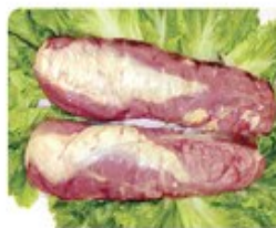
BEEF FILLET MIGNON 4UP 牛小里肌肉