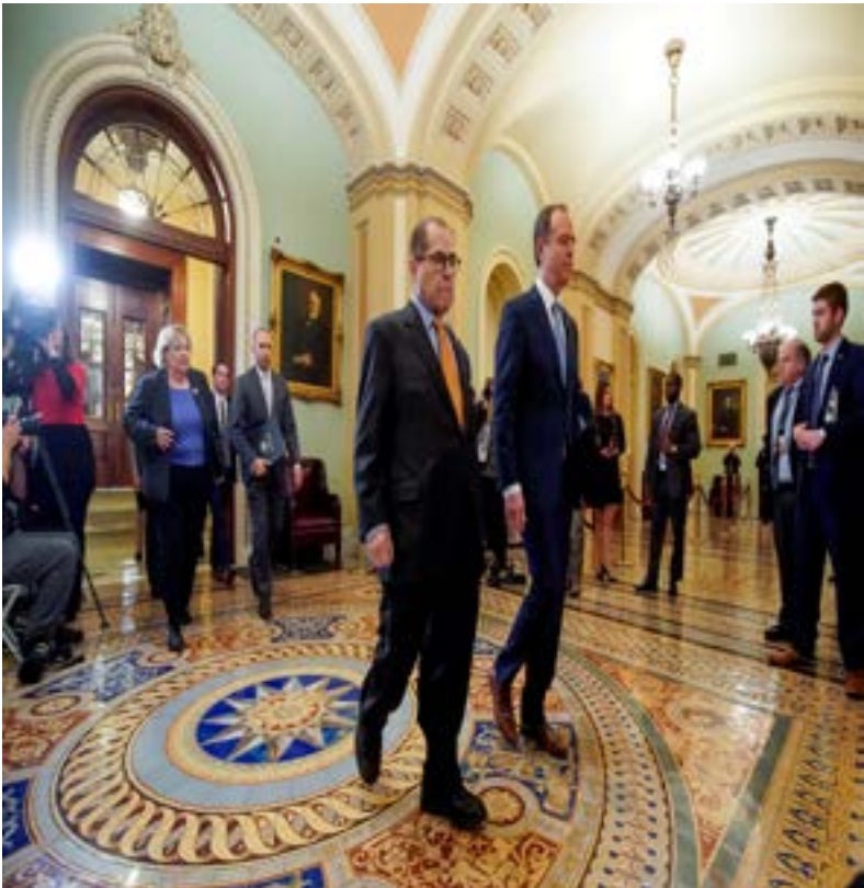
House managers arrive for the procedural start of Senate impeachment trial of President Trump in the U.S. Capitol in Washington