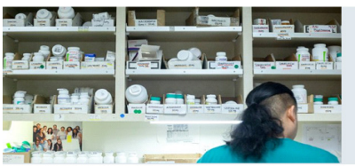
Gov. Gavin Newsom to propose that California manufacture its own generic drugs | CalMatters Taking a play from Elizabeth Warren, California could become the first state to establish its own generic drug label, the better to cut health care costs. calmatters.org