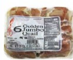
QUAIL G/D 6 JUMBO 鵪鶉