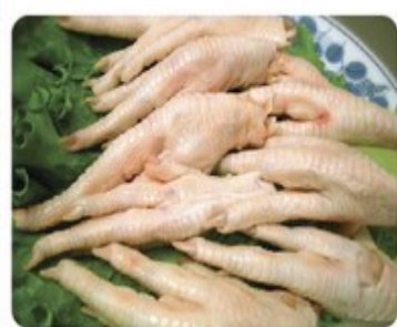
CHICKEN PAW 鳳爪