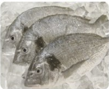
GILT HEAD SEA BREAM 希臘銀鯛魚