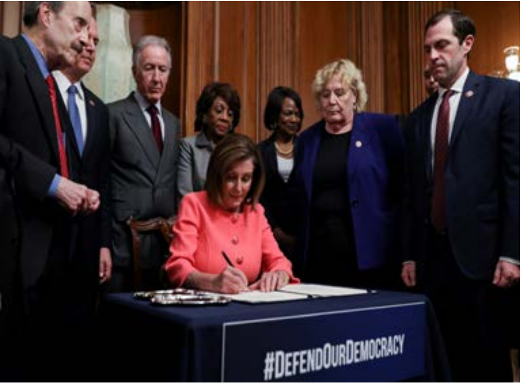
U.S. House Speaker Pelosi holds engrossment ceremony to sign Trump impeachment articles at the U.S. Capitol in Washington