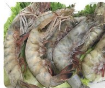
9/12 H/O GULF SHRIMP (WILD) 9/12特大野生帶頭蝦