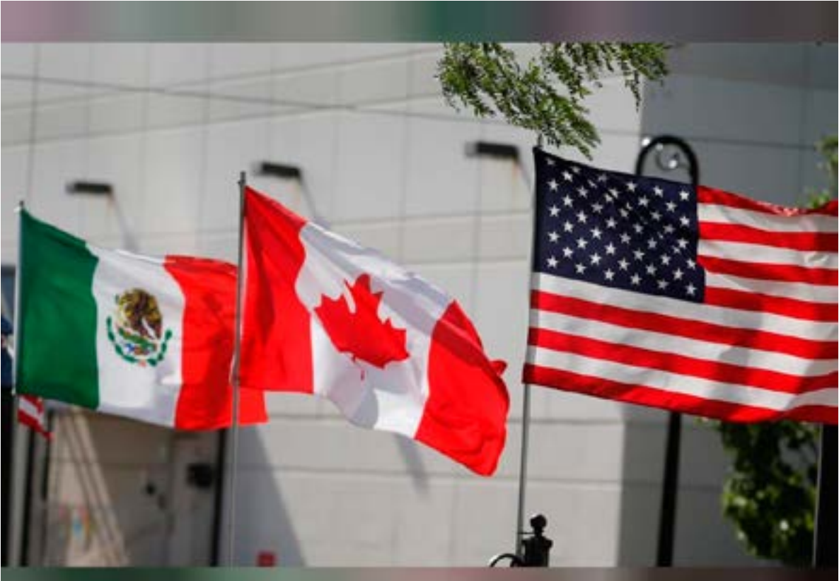
FILE PHOTO: Flags of the U.S., Canada and Mexico fly next to each other in Detroit, Michigan, U.S. August 29, 2018.

Mexican President Andres Manuel Lopez Obrador on Thursday called the deal's approval good news for the Mexican economy, and predicted it would jump start new investments.