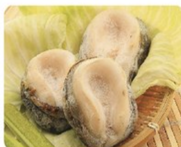
LOCUS ABALONE 智利鮑魚