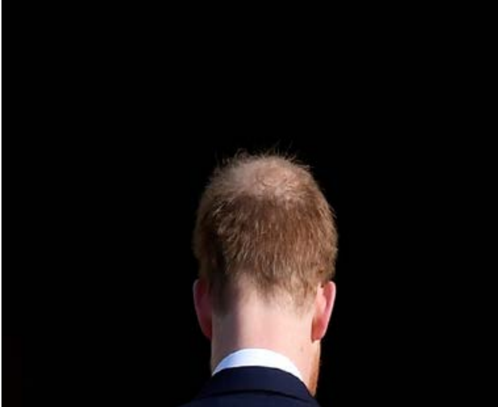
Britain's Prince Harry attends a rugby event at Buckingham Palace gardens in London