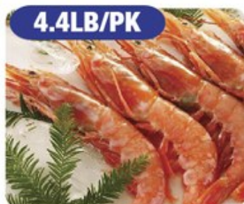
10/20 H/O ARGENTINA RED SHRIMP WILD 10/20 帶頭野生阿根廷紅蝦