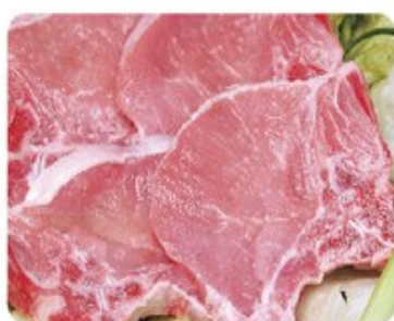
PORK CHOP WITH RIB 帶骨豬排