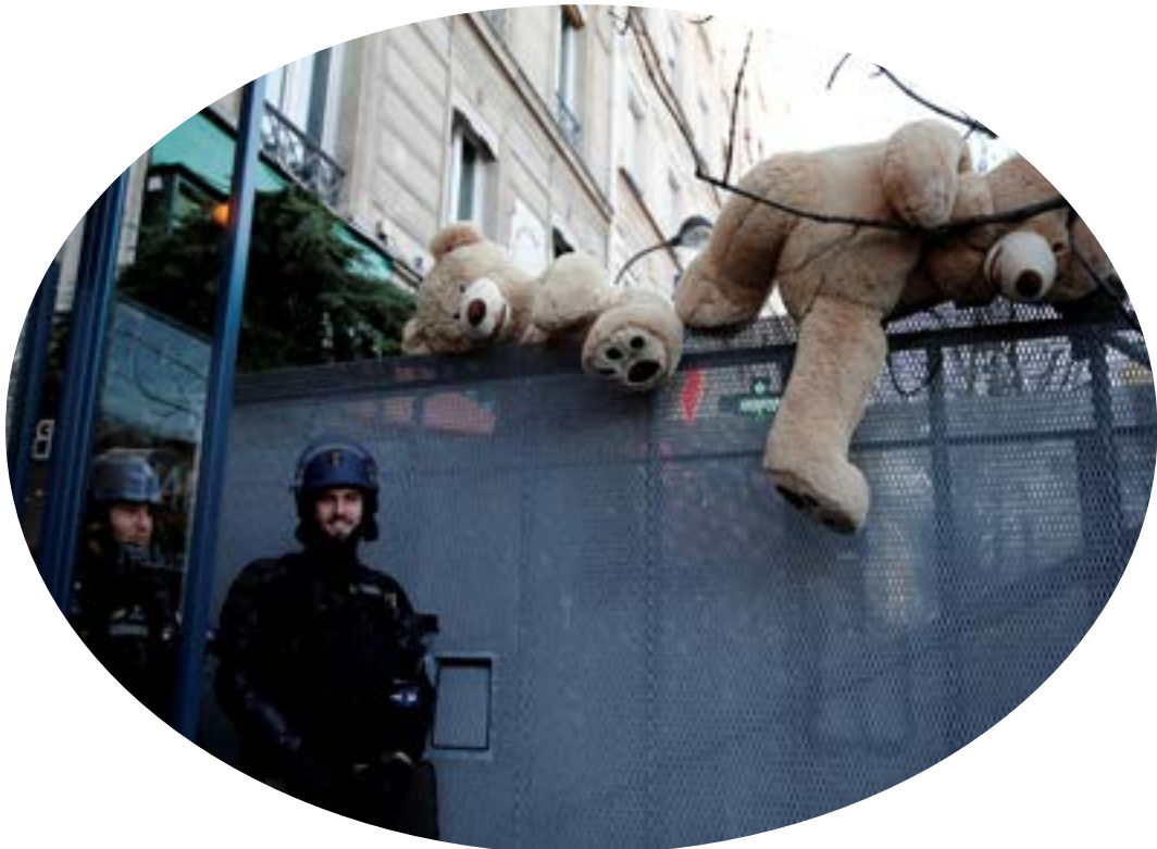
Honey-colored giant teddy bears are seen near French police during a demonstration against French government's pensions reform plans in Paris as France faces its 43rd consecutive day of strikes January 16, 2020. REUTERS/Benoit Tessier TPX IMAGES OF THE DAY