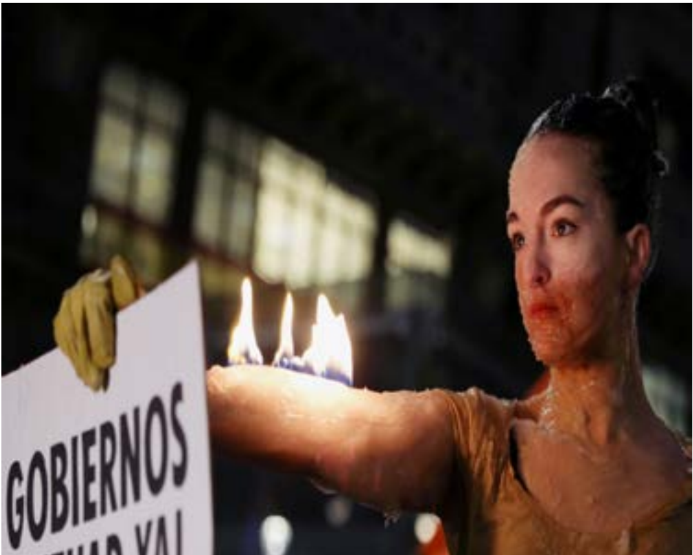
Extinction Rebellion members demonstrate over Australia's bushfires crisis in Madrid