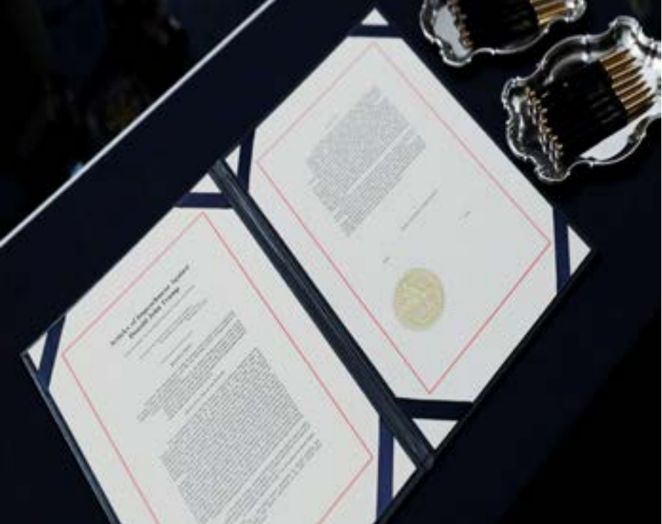
House articles of impeachment of President Trump await U.S. House Speaker Pelosi's signature before engrossment ceremony at the U.S. Capitol in Washington