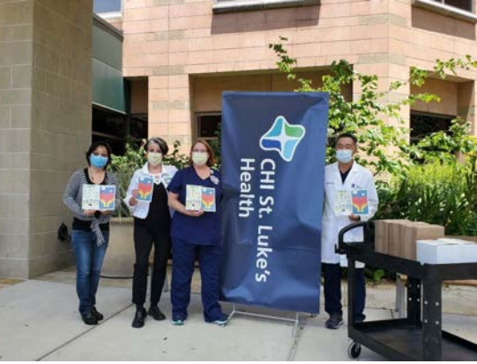
St Luke's Hospital 收到 650 個暖心卡和餐館禮卡

式購買各餐館的禮卡，幫助餐館增加營業收入，但是他們卻主動提出以捐禮卡形式來感謝醫務人員，並把禮卡的有效期限定為半年。 醫務人員們對他們的捐贈付出表示衷心感謝，並同時表示會帶家人，和告知朋友們多去他們的餐館就餐。最有意思的是有一家醫院已經給一家餐館老闆聯繫方式，希望他們今後有進一步的合作可能。 林城暖心活動帶來意想不到的結果：送出愛心，卻得到更多的愛心回報。愛心是構成社區的基礎，也是社區力量的存在。美好的世界是共同創造的，從社區做起吧！在這裡，對所有參與暖心活動的人士表示衷心的感謝！