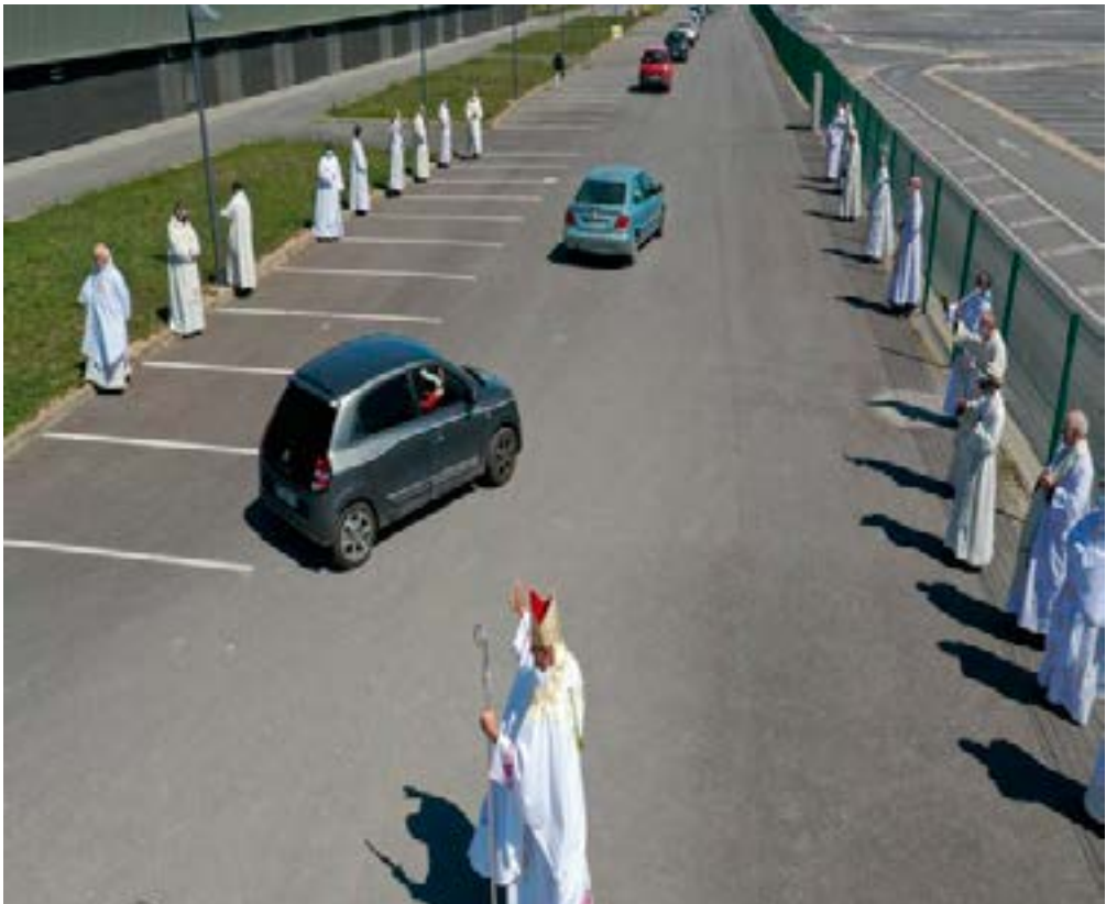
An aerial view of Archbishop Francois Touvet waving to attendees after France's first ever drive-in mass in Chalons-en-Champagne, near Reims, France.