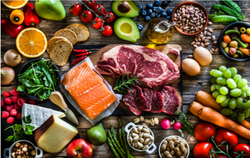
USDA has awards contracts to food producers and distributors to support its Farmers to Families Food Box Program.