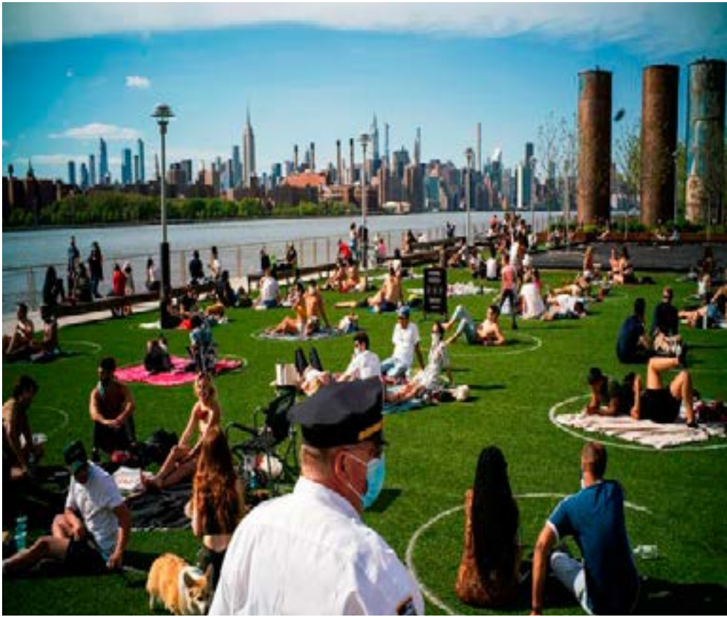
A New York Police Department officer keeps an eye on people as they control social distance on a warm day at Domino Park in Brooklyn, New York.