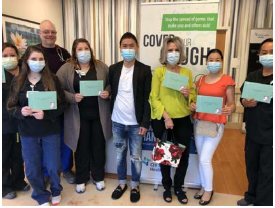
St Luke's Hospital – Springwood 收到 100 份暖心卡和餐館禮卡。