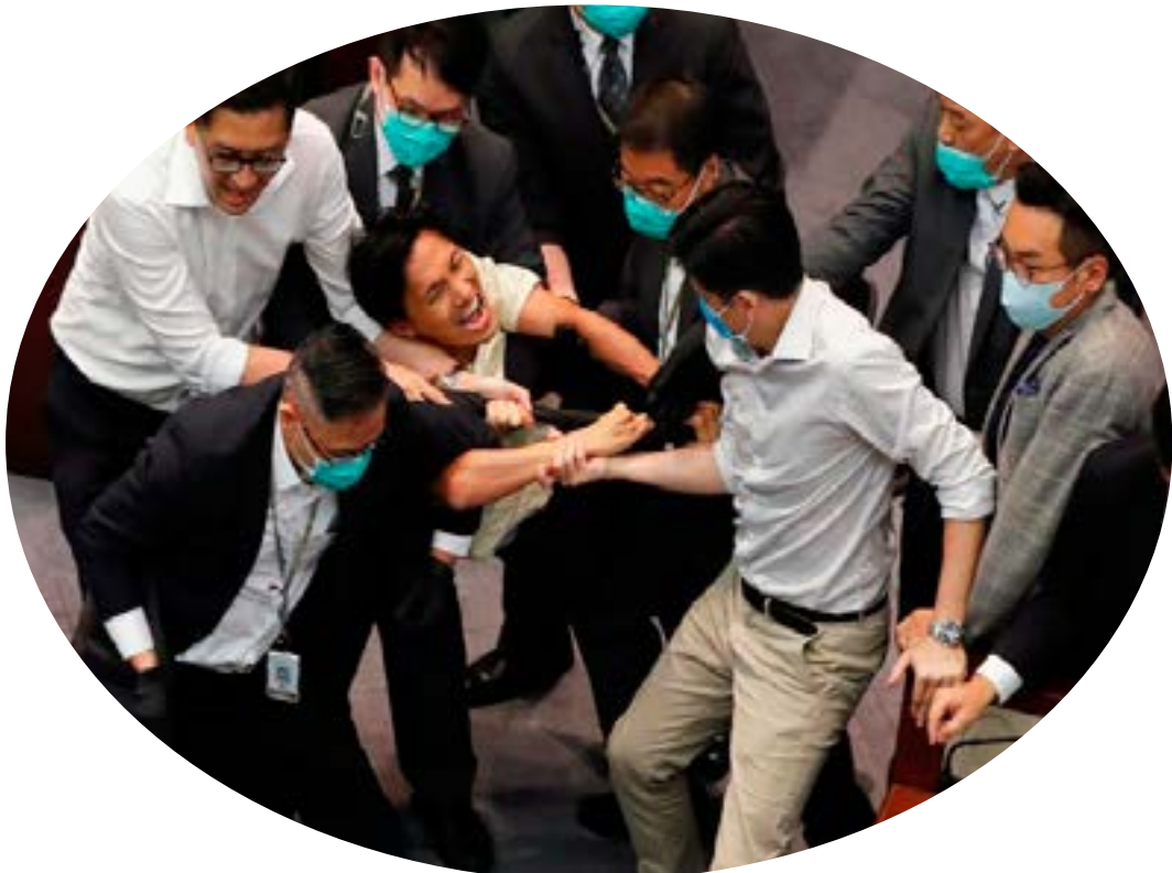
Pan-democratic legislator Chu Hoi-dick scuffles with security during Legislative Council's House Committee meeting in Hong Kong.