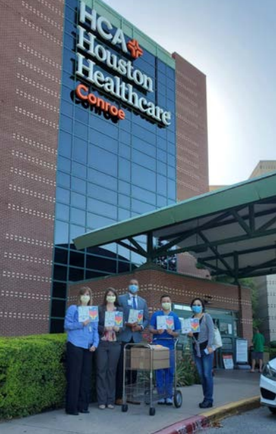
Conroe Regional Healthcare Center 收到 750 個暖心卡和餐館禮卡

(本報休斯敦報導) 一個多月前，在林城中文學校的倡導下，有林城中文學校、北休斯敦華人協會、和休斯敦亞商會等數個組織積極響應，北休斯敦地區以當地華人和 6 家餐館為主幹，開展了為護士送溫暖、和向前線英雄致敬的活動。經過一個多月的籌備和多方準備