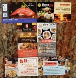
林城中國文化中心專門為參加暖心活動的 6 家餐館設計的禮卡。

(本報休斯敦報導) 一個多月前，在林城中文學校的倡導下，有林城中文學校、北休斯敦華人協會、和休斯敦亞商會等數個組織積極響應，北休斯敦地區以當地華人和 6 家餐館為主幹，開展了為護士送溫暖、和向前線英雄致敬的活動。經過一個多月的籌備和多方準備