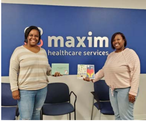
Maxim Healthcare Services 收到 20 份暖心卡和餐館禮卡。