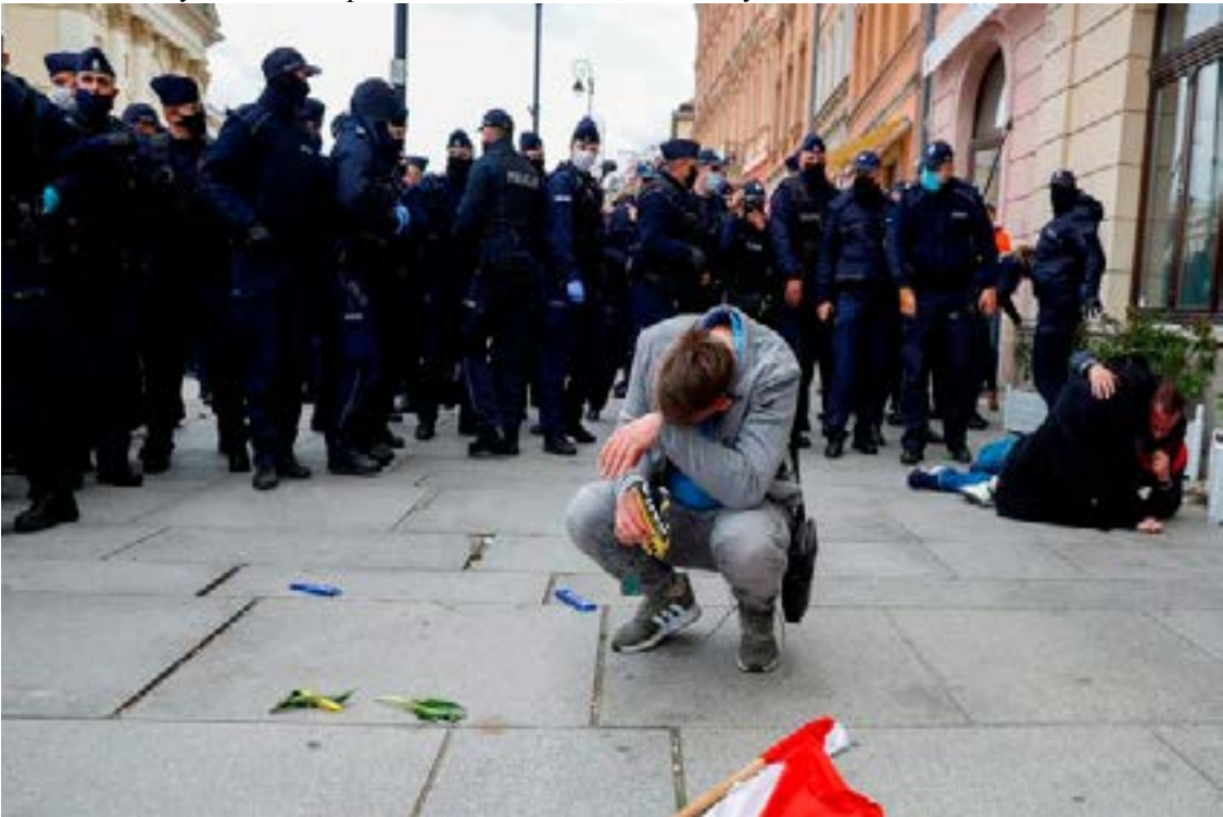
A man reacts, next to a Polish flag laying on the ground, after being sprayed with tear gas, during an anti-government protest, in Warsaw, Poland.