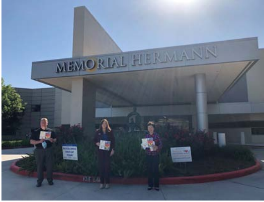
Memorial Hermann Hospital – Woodlands 收到 1150 個暖心卡和餐館禮卡