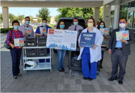
Methodist Hospital – Woodlands 收到 200 份愛心午餐和 200 個暖心卡

rant, Atsumi Asian Kitchen and Sushi Bar, DrinkabiliTea Café, 和 Spicy Cuisine。 在與林城各大醫院聯繫確定護士人數後，制出了 3000 個暖心卡和 3100 張餐券，已在 5 月 11 日國際護士節前一天，送到以下醫療機構：Memorial Hermann – Woodlands (1150)、Conroe Regional Healthcare Center (750)、St. Luke's – Woodlands (650)、St. Luke's – Springwood Village (100)、Maxim Healthcare Services (20)、華人護士群 (100)、其他個人醫務人員 (30)。 同時，在亞商會聲援 $2000 下，Airi Poke & Ramen 於當天中午為 Methodist Hospital – Woodlands 獻上 200 份香噴噴的拉麵和波霸奶茶