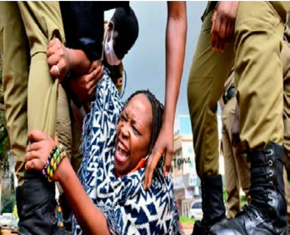
Ugandan academic Stella Nyanzi reacts as police officers detain her for protesting against the way the government is distributing relief food and the lockdown situation to control the spread of coronavirus, in Kampala, Uganda.