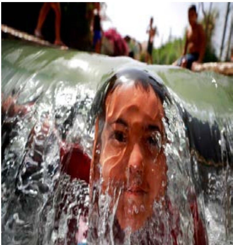
A Palestinian boy dips in a natural spring to cool off during a heat wave near Jericho in the Israeli-occupied West Bank.