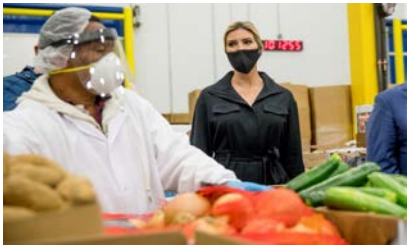
Ivanka Trump, the daughter of President Donald Trump, tours Coastal

Sunbelt Produce, Friday, May 15, 2020, in Laurel, Md. (AP Photo/Andrew Harnik) (Andrew Harnik/AP) Agriculture Secretary Sonny Perdue and White House adviser Ivanka Trump on Friday toured a Maryland food service distributor that's participating in the Farmers to Families Food Box Program. At a brief ceremony marking the program's launch at Coastal Sunbelt Produce in Laurel, Perdue gave credit to President Donald Trump. Trump had seen news reports about farm goods going to waste and said 'Sonny, I want you to bring me a program that will work,'"Perdue said. Billions of dollars worth of fruit, vegetables and other farm products that might have gone to waste because of the coronavirus pandemic will instead be delivered to food banks and nonprofit organizations that help the needy under a new Agriculture Department program.