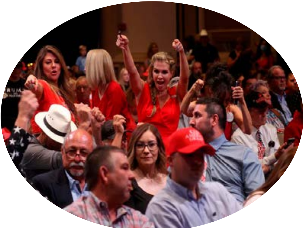
Attendees dance to the music as they wait for U.S. President Donald Trump to take the stage during a campaign event at the Arizona Grand Resort and Spa in Phoenix, Arizona.