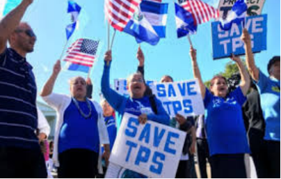
Local 32BJ of the Service Employees International Union, the largest property services