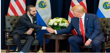
President Trump met with Salvadoran President Nayib Bukele. The government extended protections from deportation to more than 200,000 Salvadoran citizens living and working in the United States in an announcement in 2019. Under the program called Temporary Protected Status — usually reserved to help foreign nationals from countries embroiled in wars or facing natural disasters — thousands of Salvadorans were allowed to stay in the U.S. following earthquakes in 2001. The Trump Administration is extending the validity of work permits for El Salvadorans with Temporary Protected Status (TPS) through January 4, 2021.

Several TPS beneficiaries from the four countries and their children filed a lawsuit challenging the terminations, both for pro-