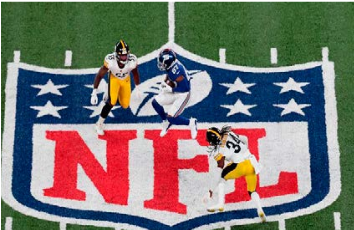
New York Giants wide receiver Sterling Shepard (87) catches a pass in front of Pittsburgh Steelers strong safety Terrell Edmunds (34) and linebacker Devin Bush (55) during the first half at MetLife Stadium in East Rutherford, New Jersey.