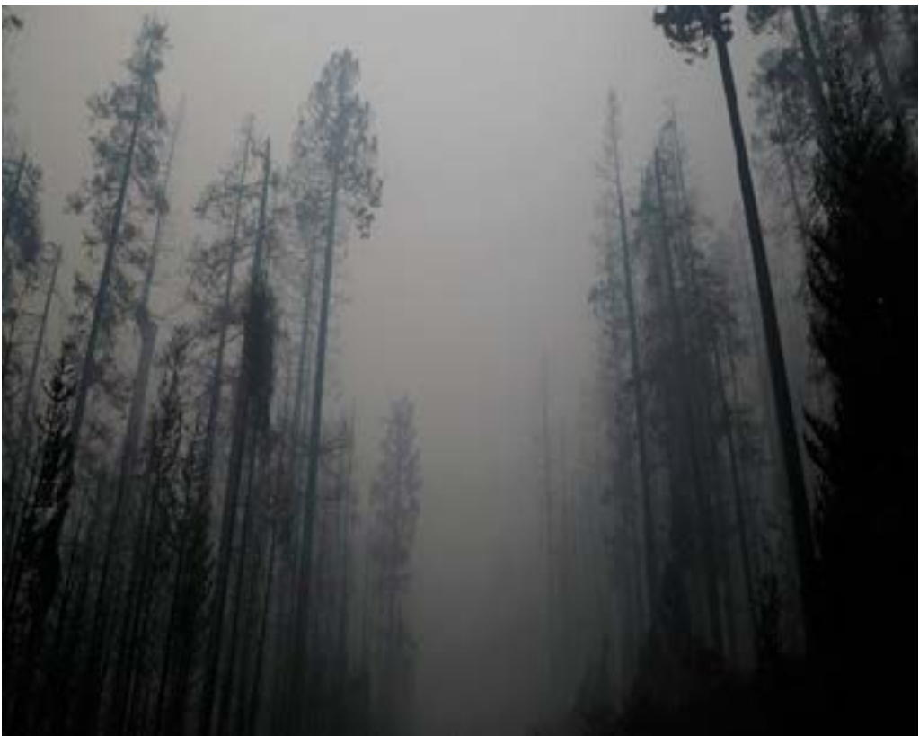
A tree blocks the road as the remains of fire damaged trees stand while smoke billows in the aftermath of the Beachie Creek fire near Detroit, Oregon.