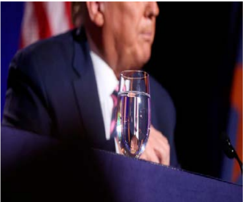
U.S. President Donald Trump is reflected in a glass of water during a campaign event at the Arizona Grand Resort and Spa in Phoenix, Arizona.