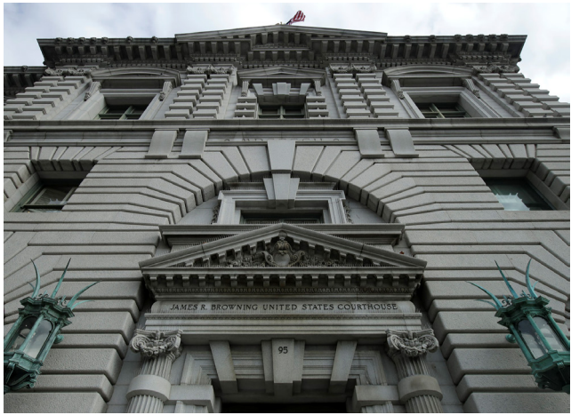
A panel of judges in the U.S. Court of Appeals for the Ninth Circuit, pictured in San Francisco, ruled on Monday that the Trump administration can end humanitarian protections for immigrants from four countries, clearing a path for their eventual deportation.