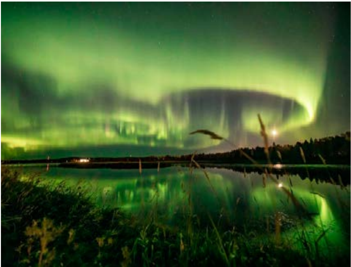
An aurora is seen in the sky in Rovaniemi, Finland.