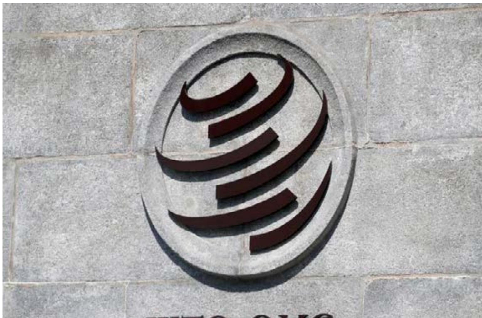
FILE PHOTO: A logo is pictured on the headquarters of the World Trade Organization (WTO) in Geneva, Switzerland, June 2, 2020.

GENEVA/BRUSSELS (Reuters) - The World Trade Organization found on Tuesday that the United States breached global trading rules by imposing multibillion-dollar tariffs in President Donald Trump's trade war with China, a ruling that drew anger from Washington.