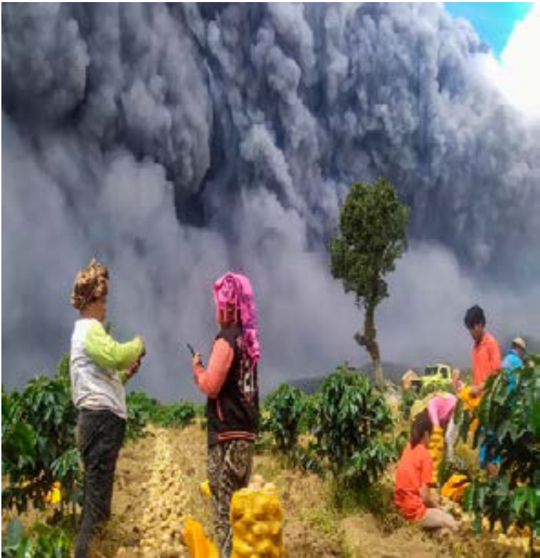
Locals harvest their potatoes as Mount Sinabung spews volcanic ash, after more than a year of inactivity, in Karo, North Sumatra province, Indonesia, August 10, 2020.