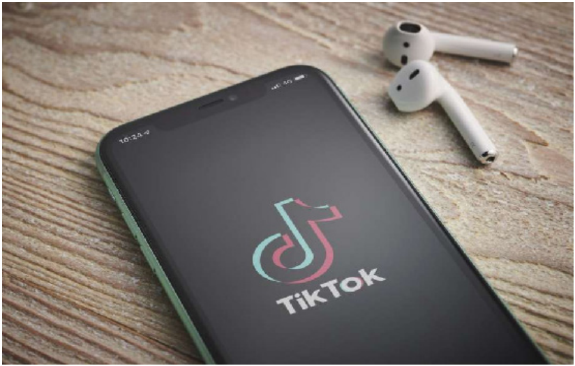
Trump approved the new Tik Tok deal and the new headquarters could possibly be in Texas.