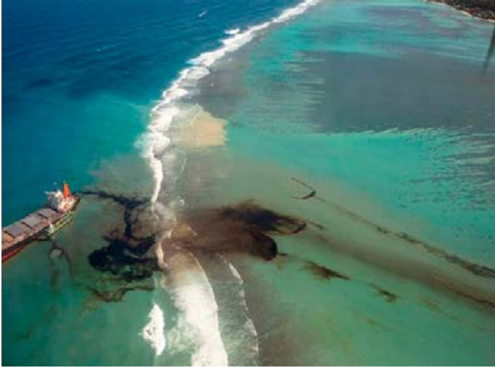
The Japanese bulk carrier ship MV Wakashio that ran aground on a reef is seen at Riviere des Creoles, Mauritius, in this handout image obtained August 10, 2020. The tanker struck a coral reef on Mauritius’ southeast coast on July 25 and began leaking 1,000 tonnes of oil across the Indian Ocean island’s most pristine beaches, raising fears of a major ecological crisis.