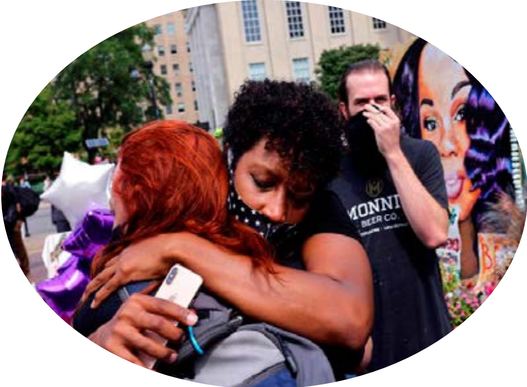
People react after a decision in the criminal case against police officers involved in the death of Breonna Taylor in Louisville, Kentucky, September 23, 2020. Protests erupted after the state attorney general announced