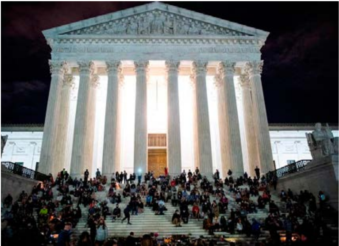
People gather in front of the Supreme Court following the death of Justice Ruth Bader Ginsburg, in Washington, September 18, 2020. Ginsburg died on September 18 of complications from pancreatic cancer at age 87. Ginsburg’s death gives Trump and his...MORE