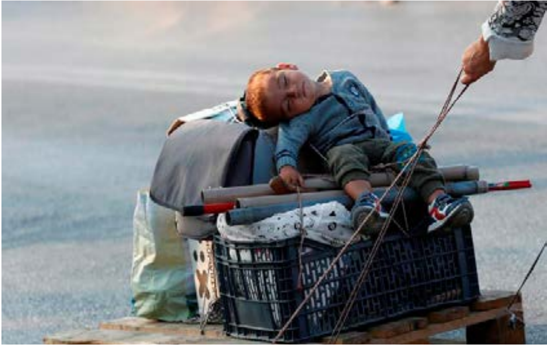
A woman pulls a baby on a pallet as they prepare to move to a new temporary camp for migrants and refugees, on the island of Lesbos, Greece, September 21, 2020. Thousands of asylum-seekers have moved into a new temporary facility