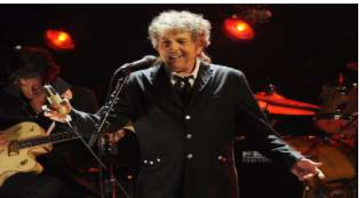
Bob Dylan performs in Los Angeles in 2012.

In New York, Fordham University’s WFUV radio station in the Bronx is set to play 80 Dylan songs on Monday in honor of his age, with the countdown kicking off at 9 a.m.