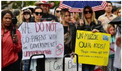
Anti-mask protests have been taking place across the country. When nine

Vaccinations have risen sharply in children 12 years and older, weeks after the Food and Drug Administration said that cohort is eligible to receive the COVID-19 vaccine made by Pfizer-BioNTech. Nearly 5 million adolescents have received at least one dose of the vaccine, according to the CDC’s latest data.