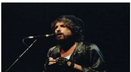
Bob Dylan sings during a concert on Sept. 6, 1987, in Tel Aviv.

Dylan, a member of the Rock & Roll Hall of Fame and Songwriters Hall of Fame, won the Academy Award for best original song in 2001 for “Things Have Changed,” which appeared in the comedy-drama “Wonder Boys.”