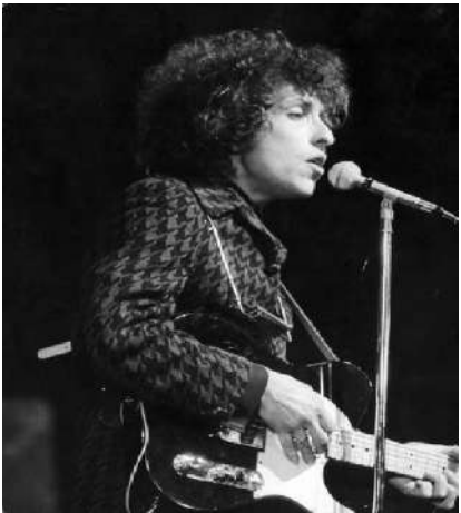
American rock and folk musician Bob

The celebration stretches beyond the United States. A “Dignity” livestream event saluting Dylan will take place Monday at the U.S. Ambassadors Residence in Dublin, with music, poetry and more on the docket. Dylan, who moved to New York City at the onset of a six-decade career, has recorded more than three dozen studio albums, beginning with his eponymous debut work in 1962. His most recent album, last year’s “Rough and Rowdy Ways,” was a huge hit, peaking at No. 2 in the U.S. and No. 1 in several countries. Revered for his poignant lyrics that gave a voice to the social unrest of the 1960s, Dylan is a 10-time Grammy winner and a 38-time nominee. His anthems “Like a Rolling Stone,” “The Times They Are A-Changin’” and “Blowing in the Wind” are considered among the greatest songs of all time, and are still relevant today in a world with a heightened social consciousness.