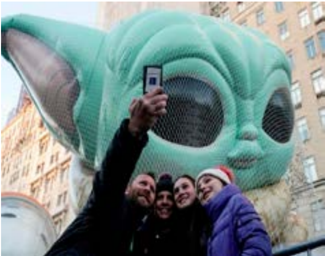
People take a selfie in front of the Grogu “Baby Yoda” balloon as it is inflated the day before the Macy’s Thanksgiving Day Parade in Manhattan, New York, November 24.