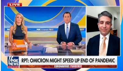
Doctor explains how omicron variant could speed up end of COVID pandemic