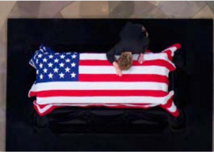
Former U.S. Senator Elizabeth Dole cries on the casket of her husband, former Senator Bob Dole (R-KS) as he lies in state in the Rotunda of the U.S. Capitol on Capitol Hill in Washington.