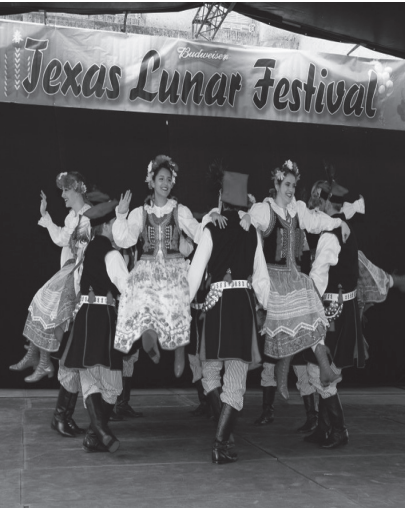
Zesty Traditional German dancing was part of this year’s Festival.

This year’s Festival had an international theme highlighting the many counties and cultures of the world and included international entertainment, acrobats, lion dances,