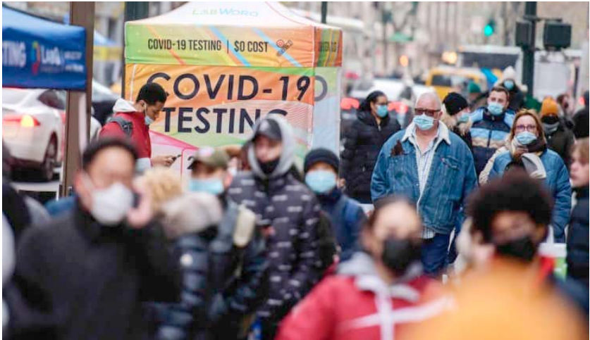
A Covid-19 testing booth in New York City on December 21, 2021.