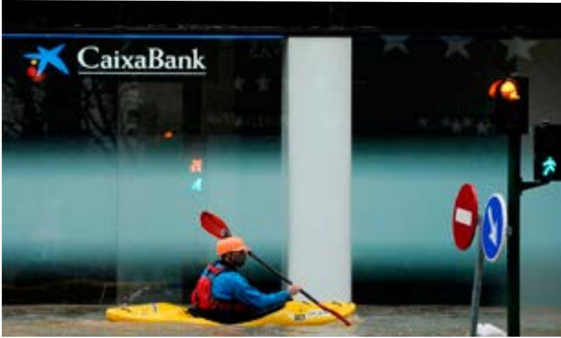
A man rides a kayak on a flooded road, following heavy rainfall in Pamplona, Spain.