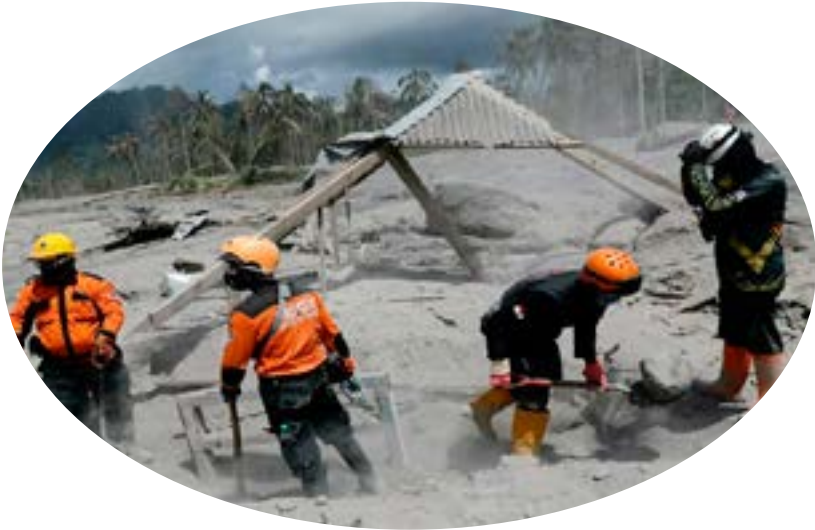
Rescuers dig a damaged building, believed to be a mosque, during an operation at an area which was affected by the Mount Semeru volcano eruption in Sumberwuluh, Candipuro district, Lumajang, East Java province, Indonesia.