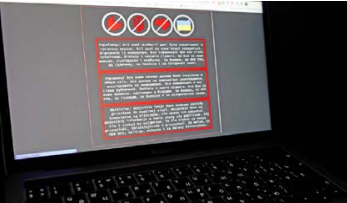
A laptop screen displays a warning message in Ukrainian, Russian and Polish, that appeared on the official website of the Ukrainian Foreign Ministry after a massive cyberattack, in this illustration taken January 14, 2022.

Russia denies plans to attack Ukraine but says it could take unspecified military action unless its demands - including a promise by the NATO alliance never to admit Kyiv - are met.