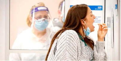
A woman uses a swab to take a sample from her mouth at an NHS Test and Trace Covid-19 testing unit at the Civic Centre in Uxbridge, Hillingdon, west London, on May 25 2021.

the sinus symptoms, the sore throat,” he said. “A couple days later, they’re ready to go back to exercising or doing their regular activity.” Omicron might infect the throat before the nose