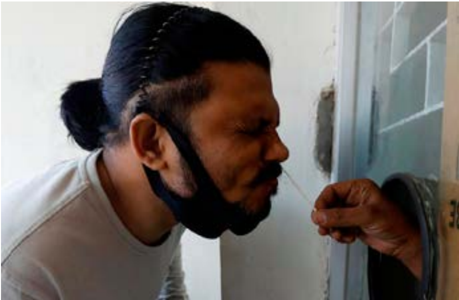
A man reacts as a paramedic takes a swab sample, to be tested for the coronavirus from a window at the School of Nursing in Jinnah Postgraduate Medical Centre (JPMC) in Karachi, Pakistan.