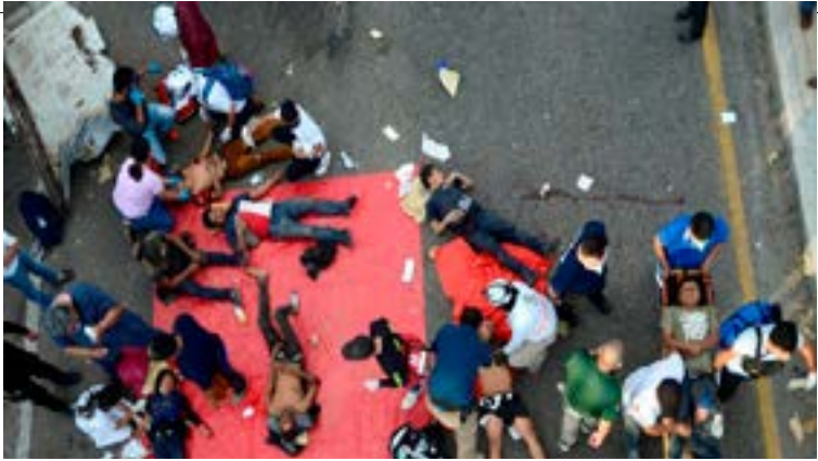
Paramedics help people injured at the site of a trailer accident that left at least 49 people dead, most of them migrants from Central America, in Tuxtla Gutierrez, in Chiapas state, Mexico.