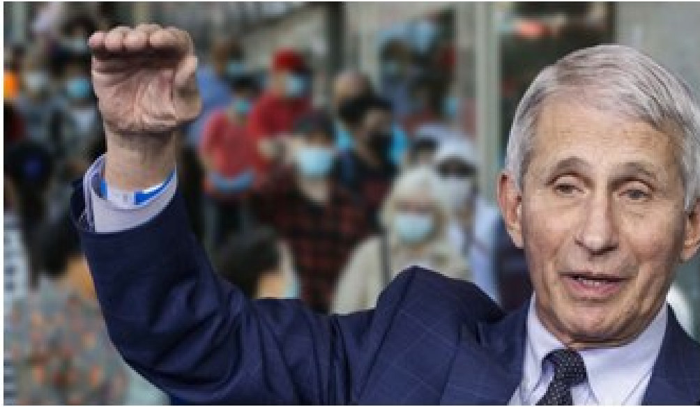
美國頂級傳染病專家福奇博士週日表示，他對大多數州在 2 月中旬之前達到 Omicron 病例高峰的前景充滿信心

與此同時，以色列衛生部週日表示，在以色列為 60 歲以上的人接種第四劑新冠病毒疫苗後，他們對嚴重疾病的抵抗力是同年齡組接種三次疫苗的人的三倍。衛生部還表示，第四劑或第二劑加強劑使 60 歲以上的人對感染的抵抗力是接種三針疫苗的年齡組的兩倍。以色列 Sheba 醫療中心上週一發表的一項初步研究發現，第四針將抗體提高到比第三針更高的水平，但可能沒有達到完全抵禦高度傳播的 Omicron 變體的程度。