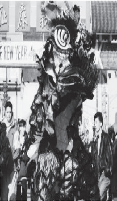
Lunar Festival Dragon Dance in the 1920’s in the U.S.

Today the spirit of the Traditional Chinese New Year lived on in the 26th Annual Texas Lunar New Year Festival (www.texaslunarfest.net held live online this year due to the Covid-19 pandemic. This is the largest celebration of Asian culture in the south central part of the United States.