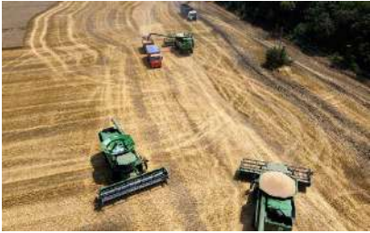
Farmers harvest with their combines in a wheat field near the village Tbiliskaya, Russia, July 21, 2021. The Russian tanks and missiles besieging Ukraine also are threatening the food supply and livelihoods of people in Europe, Africa and Asia who rely on the vast, fertile farmlands known as the “breadbasket of the world.” Russia and Ukraine combine for about a third of the world’s wheat and barley exports and provide large amounts of corn and cooking oils.

dairy if farmers are forced to pass along costs to customers.