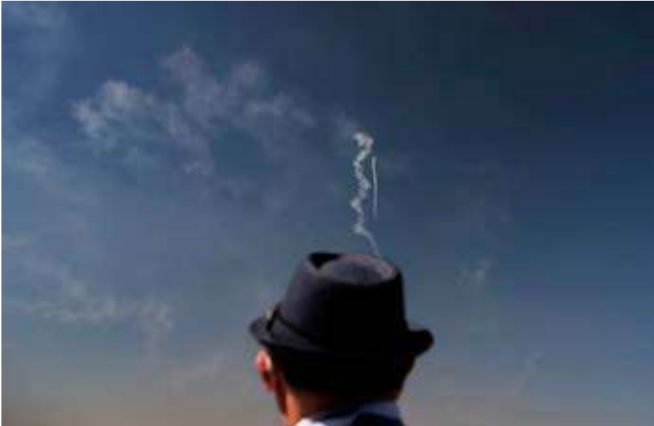
A Chilean Air Force's aerobatics team member performs ahead of the International Air and Space Fair (FIDAE) at Santiago international airport, Chile April 4.