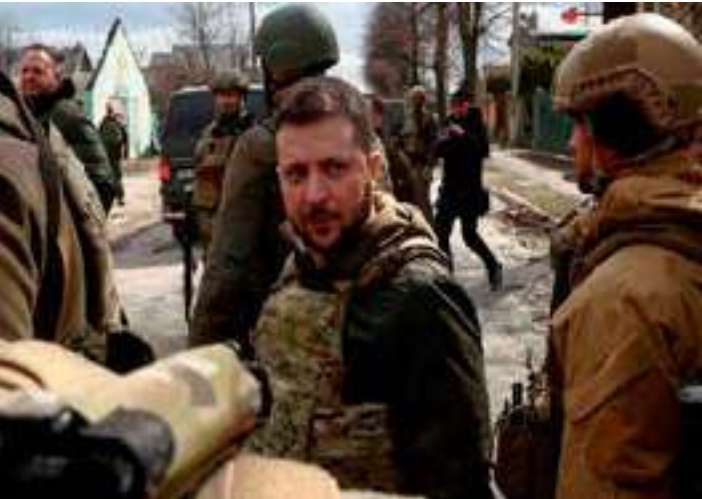
Ukraine's President Volodymyr Zelenskyy looks on as he is surrounded by Ukrainian servicemen as Russia's invasion of Ukraine continues, in Bucha, outside Kyiv, Ukraine, April 4.