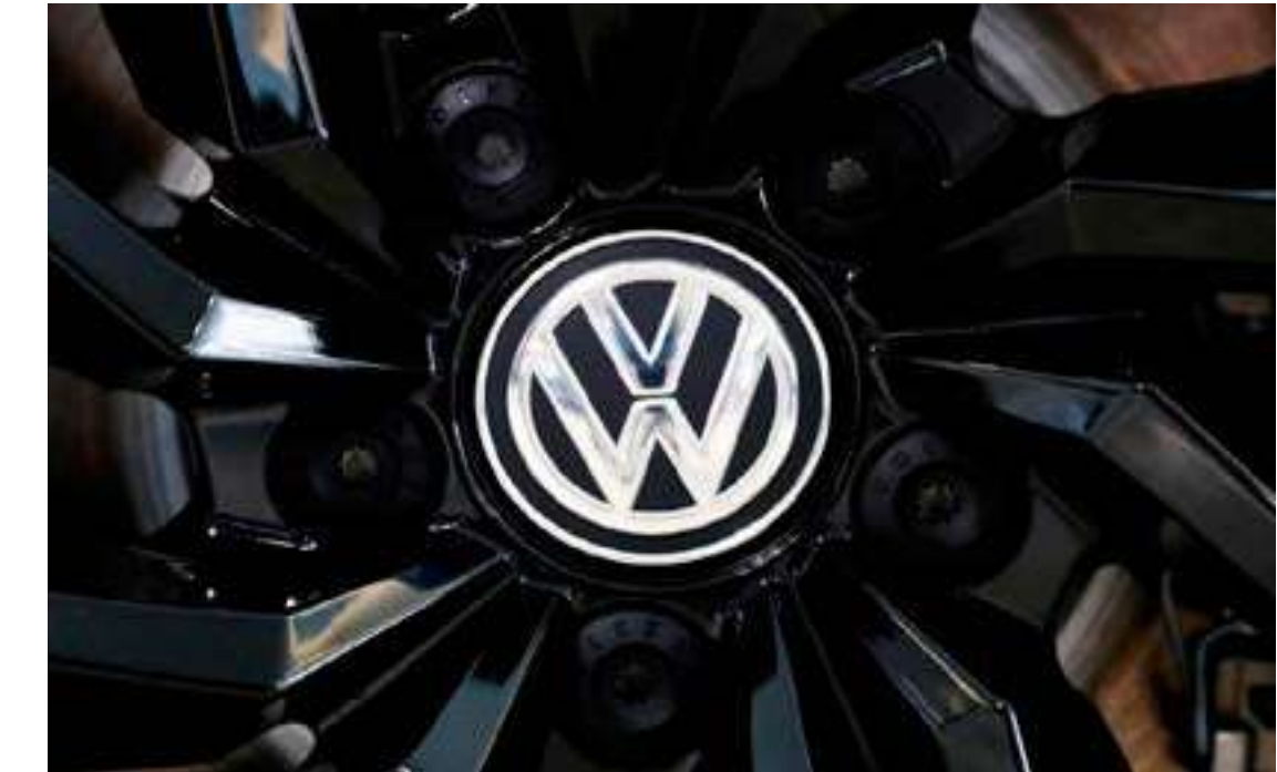
The logo of German carmaker Volkswagen is seen on a rim cap in a showroom of a Volkswagen car dealer in Brussels, Belgium July 9, 2020.

Others to sign include the fund arm of HSBC (HSBA.L), French public