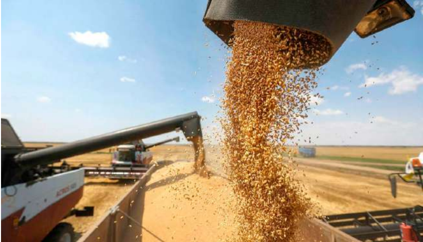
Farmers harvest with their combines in a wheat field near the village Tbiliskaya, Russia, July 21, 2021. The Russian tanks and missiles besieging Ukraine also are threatening the food supply and livelihoods of people in Europe, Africa and Asia who rely on the vast, fertile farmlands known as the “breadbasket of the world.” Russia and Ukraine combine for about a third of the world’s wheat and barley exports and provide large amounts of corn and cooking oils.