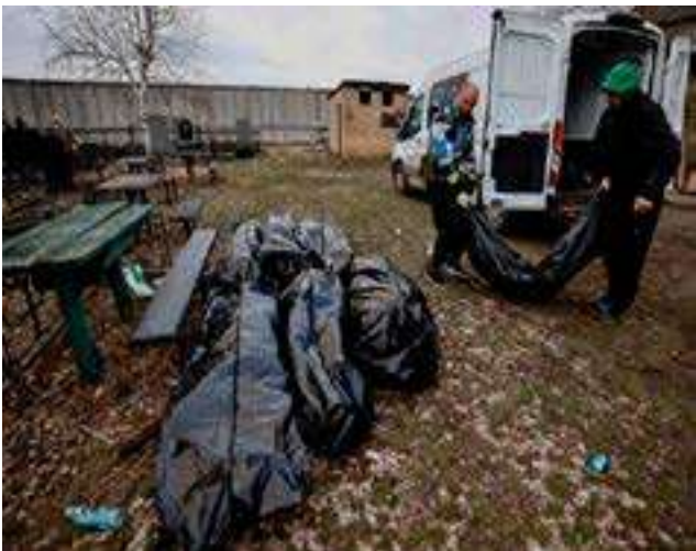
Volunteers unload from a van bags containing bodies of civilians after they collected them from the streets to gather them at a cemetery before they take them to the morgue in Bucha, in Kyiv region, Ukraine April 4.