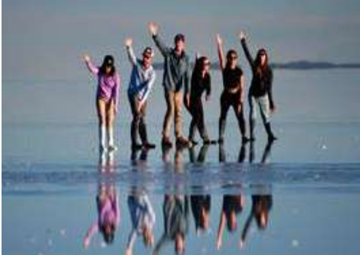
Tourists line up for a photo, at the Uyuni Salt Flat in Bolivia.