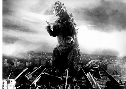
A Poster For The Movie, "Godzilla," In 1954.

Moderna: Data suggests larger booster dose increases antibodies Biotechnology company Moderna announced Monday that preliminary data suggests its half-dose booster shot increased antibody levels against Omicron compared with the levels seen when a fully vaccinated person does not receive a booster – but a larger-sized dose of the booster increases antibody levels even more.