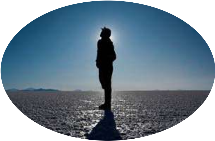
A man stands on salt at the Uyuni Salt Flat in Bolivia.