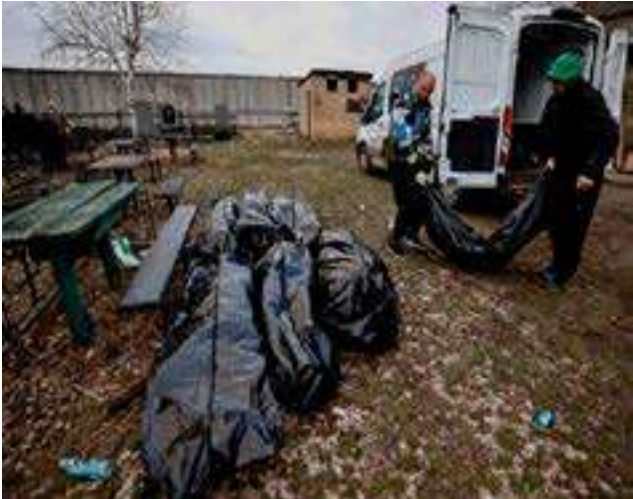
A man walks on salt at the Uyuni Salt Flat, Bolivia. Picture taken with a drone.