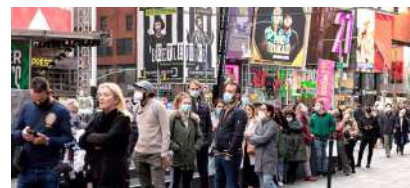
People wait in line to get tested for