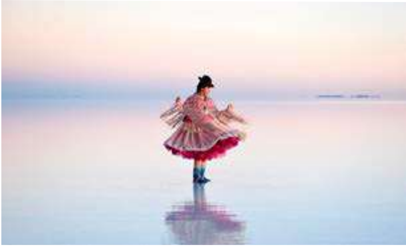
A woman in a Cholita dress poses for photos, at the Uyuni Salt Flat in Bolivia, March 26, 2022.