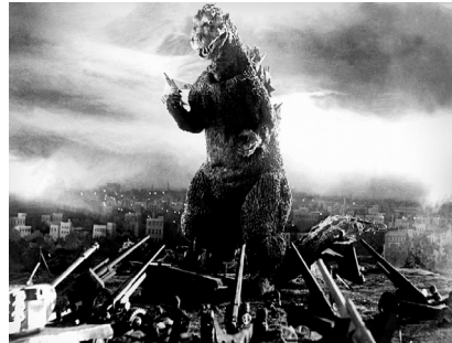
A Poster For The Movie, "Godzilla," In 1954.

Historical Point As strange as it may seem, the storyline of the science fiction movie thriller "Godzilla" in 1954 about a monster that rises unexpectedly out of the Sea of Japan and threatens the survival of humanity closely draws an eerie parallel to the rapid movement of the Omicron Covid-19 variant into the U.S. in 2021-2022 that also promises more illness and death to a country that is already struggling with the tragic loss of more than 800,000 of its citizens to the Covid-19 virus. Sadly, the "Omicron Invasion" is not a movie. But we are confident for a "happy ending." Thousands of medical professionals are working night and day to find the right vaccines and treatments to counteract the virus. We urge all our readers to never lose confidence and to always keep the faith.