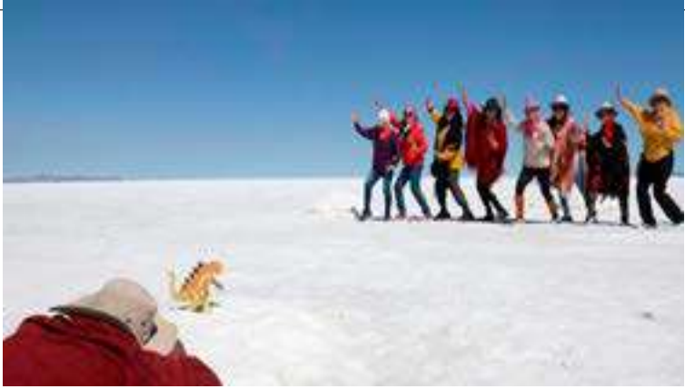
A boy takes photos of tourists behind a toy dinosaur for a fee, at the Uyuni Salt Flat in Bolivia.