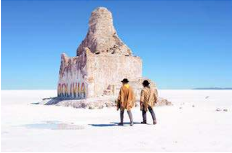
Tourists walk in front of a structure made of salt, at the Uyuni Salt Flat in Bolivia.