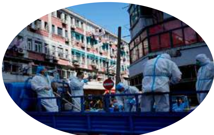
Workers in protective suits stand on a truck as the city prepares to end the lockdown placed to curb the coronavirus outbreak in Shanghai, China.