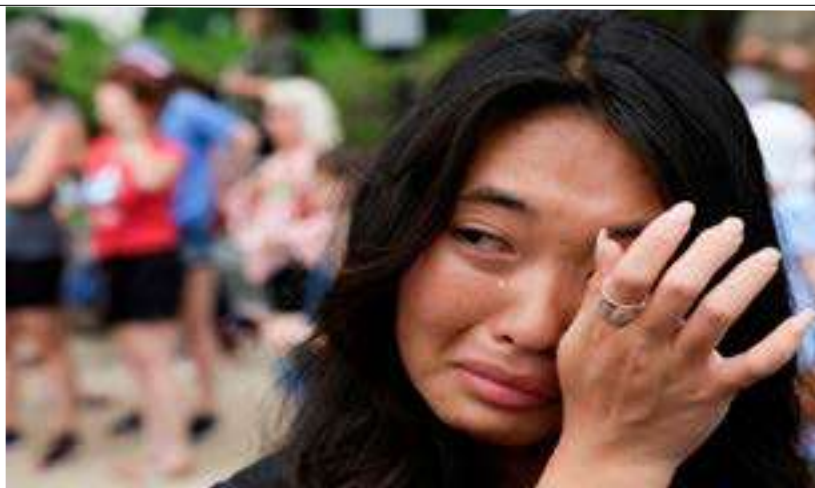
Abortion rights demonstrator reacts outside the United States Supreme Court in Washington, June 24, 2022.