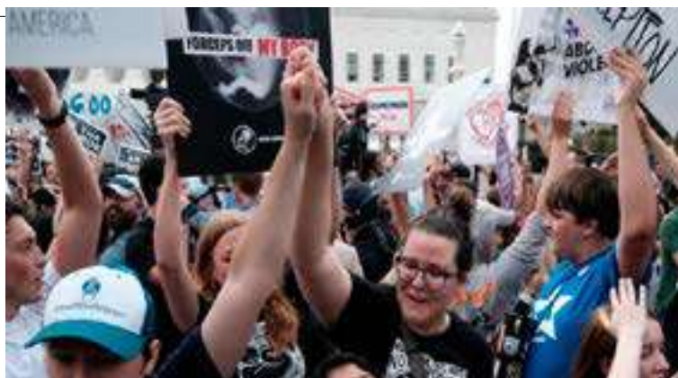
Anti-abortion demonstrators celebrate outside the United States Supreme Court in Washington, June 24, 2022.