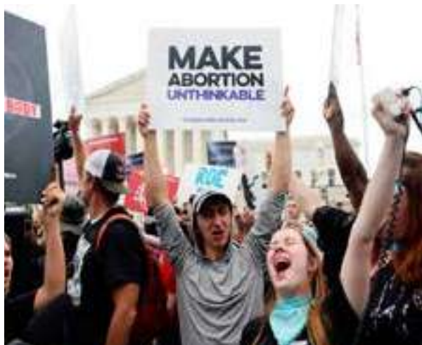
Anti-abortion demonstrators celebrate outside the United States Supreme Court in Washington, June 24, 2022.