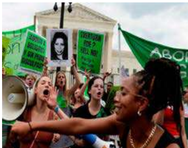
Abortion rights supporters demonstrate outside the United States Supreme Court in Washington, June 24, 2022.