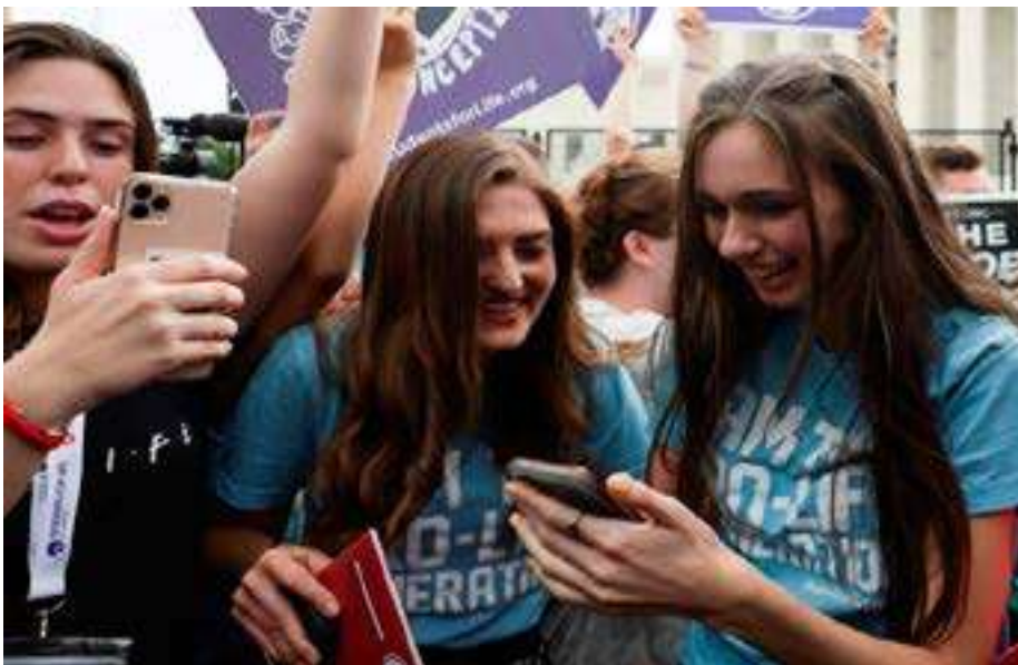
Anti-abortion demonstrators celebrate outside the United States Supreme Court in Washington, June 24, 2022.