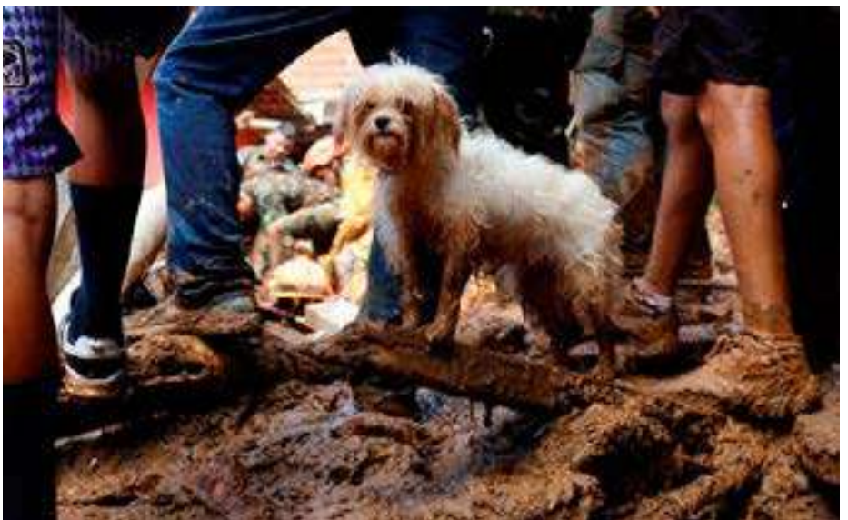
A dog covered in mud is seen at one of the landslide sites after severe rainfall at Barra do Sahy, in Sao Sebastiao, Brazil, February 21.