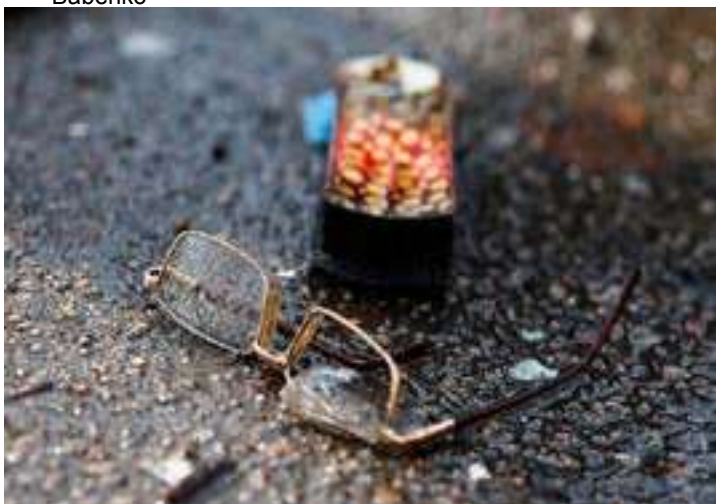
Damaged glasses lie on the ground at a bus station destroyed after a shelling, amid Russia's attack on Ukraine, in Kherson, Ukraine February 21.