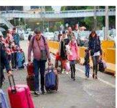
Ukrainians families gather their belongings hoping to cross the border into the U.S.