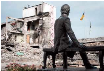
A statue of Ukrainian poet, writer and artist Taras Shevchenko is seen in front of the destroyed Palace of Culture in the retaken city of Derhachi, in the Kharkiv region of Ukraine, on September 20.

Once complete, it will shorten the rail freight journey from China to Europe, which currently goes through Russia, by 900km. This new route through Central Asia had long been considered but previously did not proceed, partly because it went against Russia's strategic and economic interests.