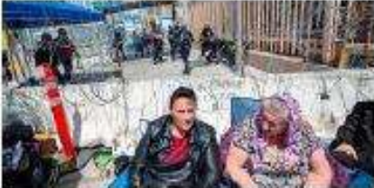
Two Ukrainian women sit and wait for U.S. Customs

Ukrainians who are seeking asylum in the United States gather in a city government shelter for Ukrainians, amid the Russian invasion of Ukraine, on April 6, 2022 in Tijuana, Mexico. Authorities opened the nearby El Chaparral port of entry today solely for the processing of Ukrainian asylum-seekers. U.S. authorities are allowing Ukrainian refugees to enter the U.S. at the Southern border in Tijuana with permission to remain in the country on humanitarian parole for one year.