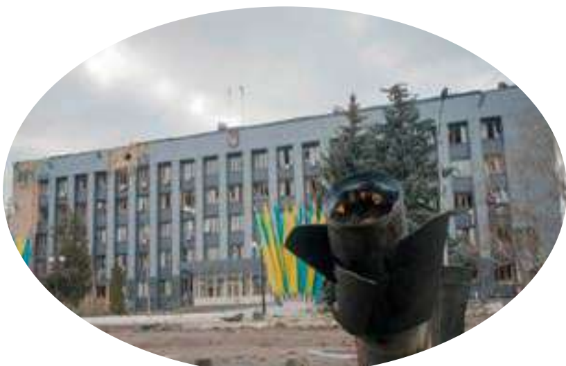
A part of a rocket is seen near a building damaged by a Russian military strike, amid Russia's attack on Ukraine, in the front line city of Bakhmut, Ukraine February 21.