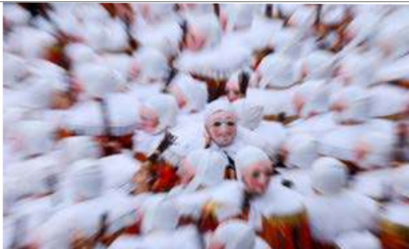
People wearing 'Gilles' masks and costumes take part in the Binche carnival, a UNESCO World Heritage event, in Binche, Belgium February 21, 2023.