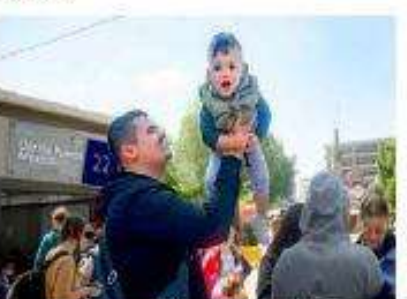
A father holds his son up to see the massive group of his fellow countrymen scattered together in a foreign land.