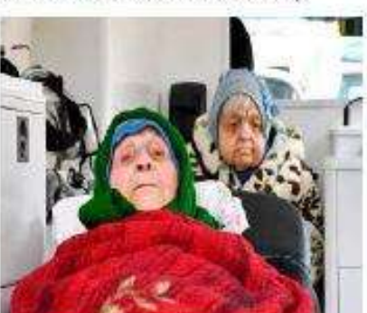
Elderly woman being transported by a relative.