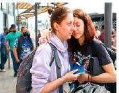
Family members offer each other comfort in the uncertain time.