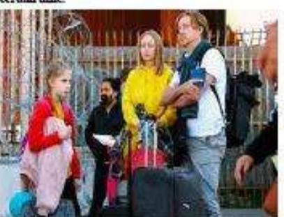
A Ukrainian family contemplates the future in a new country.