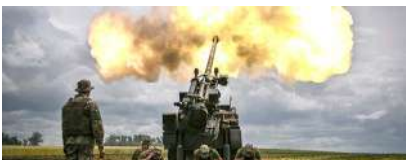
Ukraine Soldiers Fire Long-Range Artillery At Enemy Troops

Last week, many eyes were trained on the ancient city of Samarkand for the annual meeting of the Shanghai Cooperation Organization (SCO). Coming at a time of mounting global challenges and geopolitical tensions, the summit showed the importance of the SCO and China's role in promoting multilateralism, connectivity and development in Central Asia and beyond.