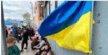
The Ukrainian Flag hung on the side of a building offers solace to some.