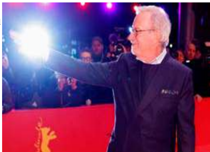
Director Steven Spielberg waves on the red carpet as he attends a ceremony in which he is to receive the Honorary Golden Bear Award for Lifetime Achievement at the 73rd Berlinale International Film Festival in Berlin, Germany, February 21.