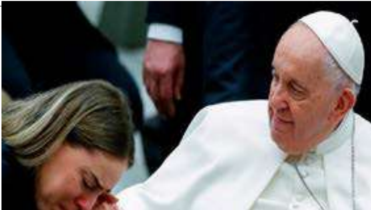
A woman cries on Pope Francis hand while he greets people as he arrives for the weekly general audience at the Vatican, February 22.