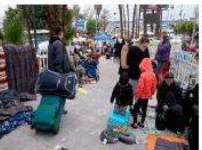
Ukrainians wait for processing by US authorities at the Tijuana-Mexico border.