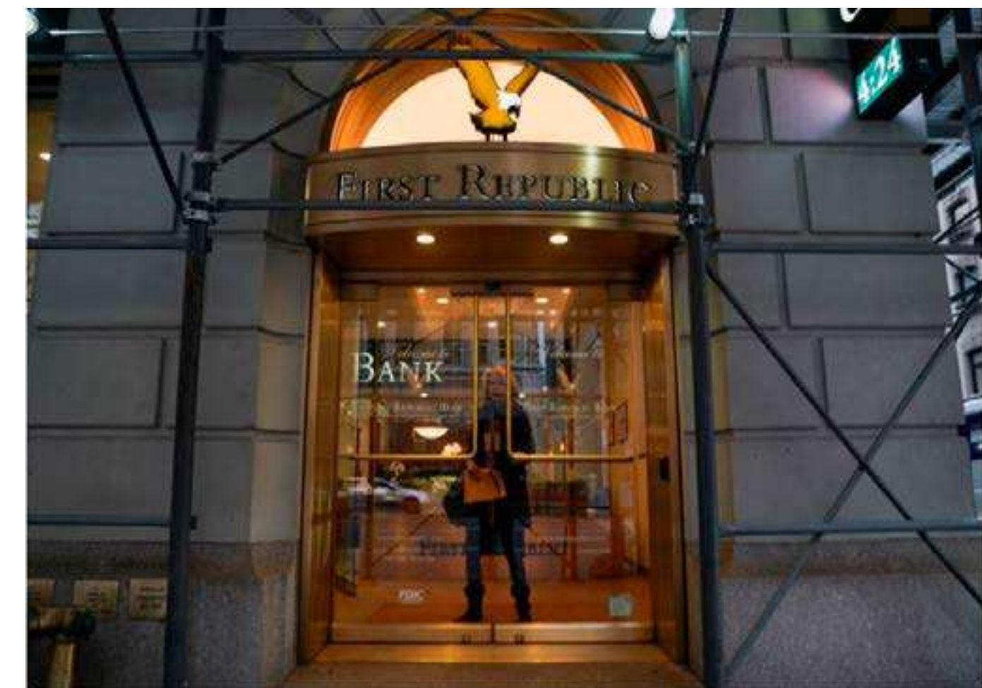
A view of the Park Avenue location of the First Republic Bank, in New York City, U.S., March 10, 2023.

That surpassed a previous high set during the most acute phase of the financial crisis some 15 years ago.