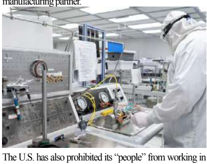
the Chinese semiconductor industry without a license. The measures will cost the global industry nearly $10 billion over the next three years because of lost sales of goods and services to China, he added.

from the U.S. chip sanctions to be in the $8 billion range, "or 8% of the average of our annual wafer fab equipment forecast for the 2022-2025 period," Hosseini wrote. "On the supercomputer side, we see an approximate 10% downside risk to our estimates for TSMC, the main GPU manufacturing partner.