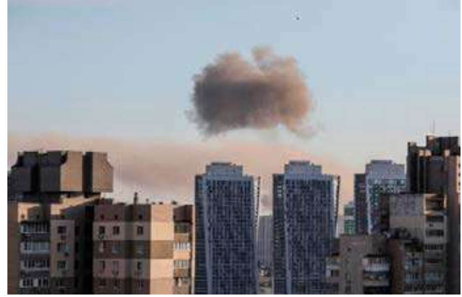
Smoke rises after a missile strike in Kyiv, Ukraine.