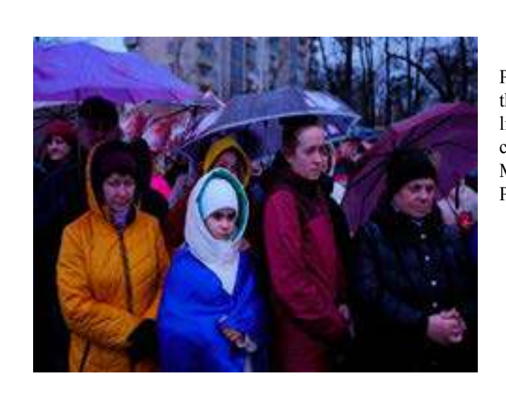
People attend a vigil marking the first anniversary of the liberation of the town of Bucha, outside Kyiv, Ukraine, March 31.

People gather near the rubble of a grandstand that collapsed in a bullring during the celebrations of the San Pedro festivities, in El Espinal, Colombia.