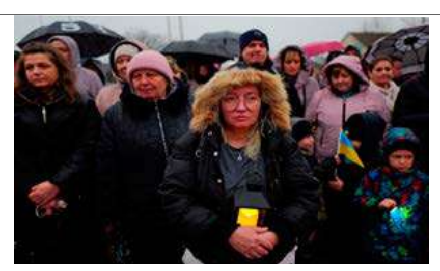
People attend a vigil marking the first anniversary of the liberation of the town of Bucha, outside Kyiv, Ukraine, March 31.