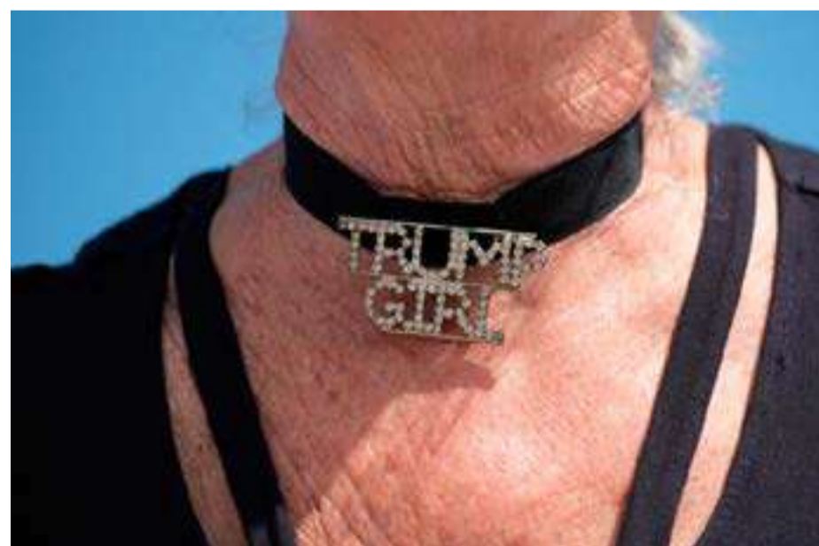
A supporter of former U.S. President Donald Trump wears a choker necklace that says "Trump Girl" outside his Mar-a-Lago resort after he was indicted by a Manhattan grand jury following a probe into hush money paid to porn star Stormy Daniels, in Palm Beach, Florida.