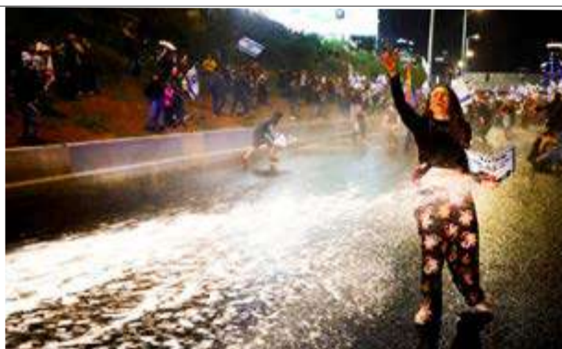
A woman gestures while being sprayed by a water canyon during a demonstration against Israeli Prime Minister Benjamin Netanyahu and his nationalist coalition government's plan for judicial overhaul, in Tel Aviv, Israel.