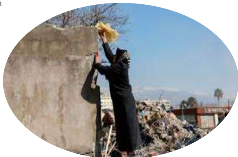
A woman takes bread out of the rubble of her house, in the aftermath of a deadly earthquake in Kahramanmaras, Turkey.