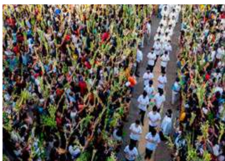
Filipino Catholics wave their palm fronds for blessing during a Palm Sunday mass at the Antipolo Cathedral in Antipolo City, Rizal province, Philippines.