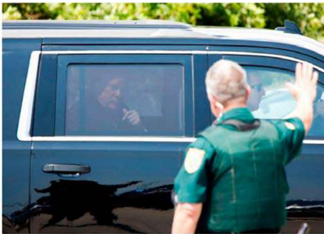
Former U.S. President Donald Trump gestures in a vehicle as he leaves his Mar-a-Lago resort after he was indicted by a Manhattan grand jury following a probe into hush money paid to porn star Stormy Daniels, in Palm Beach, Florida, U.S., April 3, 2023.

Before the indictment, a Manhattan grand jury heard evidence