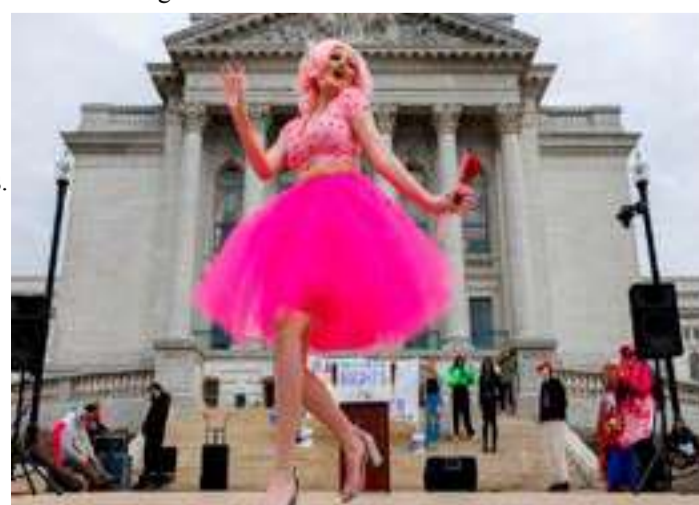
A drag performer dances at the end of the "Rally for Our Rights", ahead of the 2023 Wisconsin Supreme Court election, outside the Wisconsin State Capitol in Madison, Wisconsin.