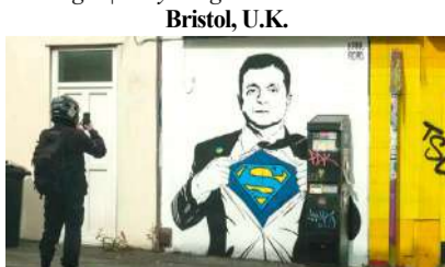
Bristol, U.K. Artwork of Ukrainian president Volodymyr Zelenskiy being portrayed as Superman is seen on a