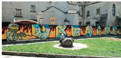
A woman sits in front of a graffiti tribute to the Ukrainian Military and their ongoing war with Russia.