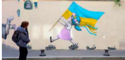
A fresco mural by French street artist Julien Malland