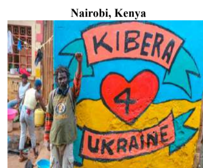
Nairobi, Kenya An artist showing a protest symbol power sign by a street mural created by a group of Artists from Maasai Mbili depicting Kibera’s love for Ukraine amidst the war.