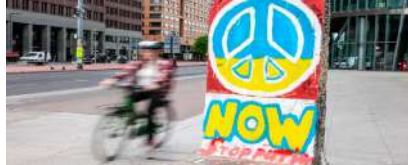
A cyclist passes by a part of the Berlin Wall de-