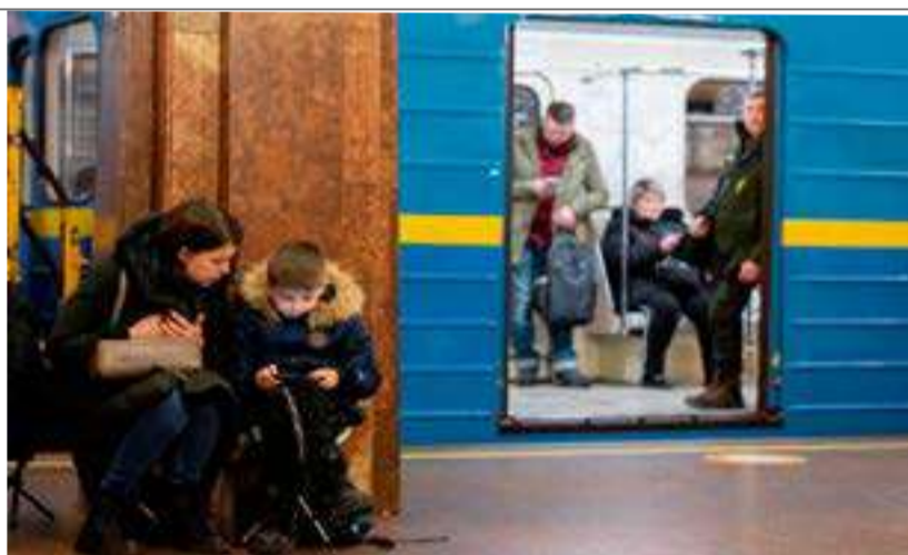
People take shelter inside a metro station during massive Russian missile attacks in Kyiv, Ukraine December 29, 2022.