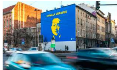
Krakow, Poland A mural depicting Ukrainian president Volodymyr Zelenskiy and ‘Glory to Ukraine’ slogan written in Polish is seen in Krakow, Poland on 22 March, 2022.