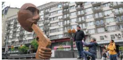
People take pictures of a sculpture depicting the President of Russia Vladimir Putin called “Shoot yourself” in the centre of Kyiv.