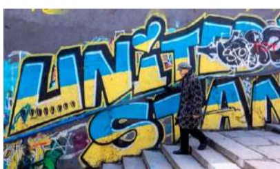
VILNIUS, LITHUANIA - APRIL 26: Street art paintings which supports Ukraine on April 26, 2022 in Vilnius, Lithuania. Russia invaded neighbouring Ukraine on February 24, 2022, and has been met with worldwide condemnation in the form of rallies, protests and peace marches taking place in cities across the globe.