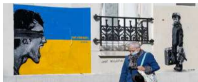
Paris Fresco murals by French street artists Kedu Abstract and Jeff Aerosol are displayed on the wall of a Parisian building on March 14, 2022 in Paris, France.