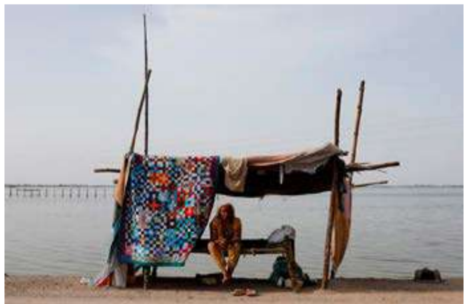
A flood victim takes refuge along a road in a makeshift tent, following rains and floods during the monsoon season in Mehar, Pakistan.