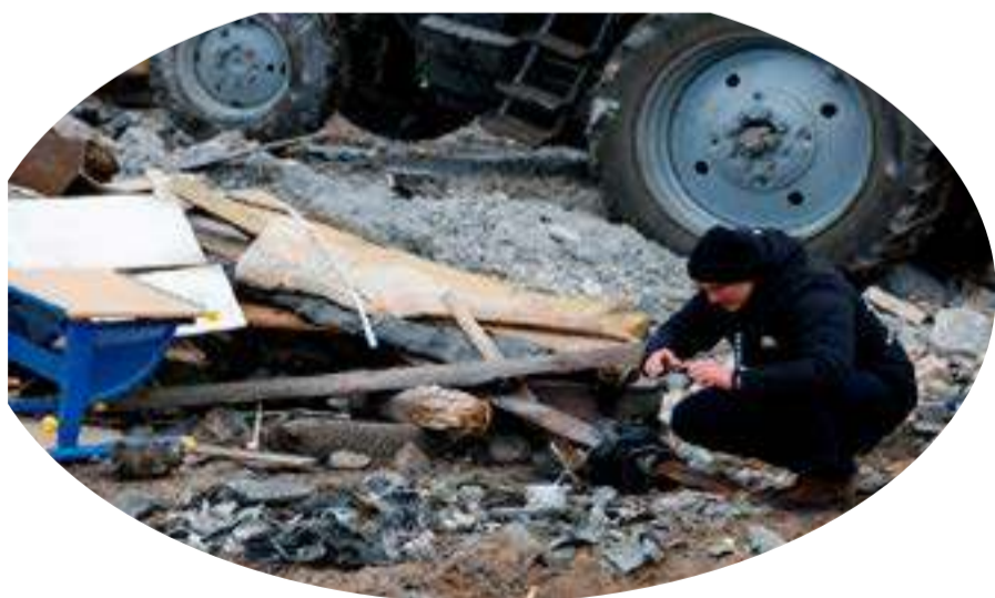
A police investigator takes pictures as he works at a site of a residential house damaged during a Russian missile strike in Kyiv, Ukraine December 29, 2022.