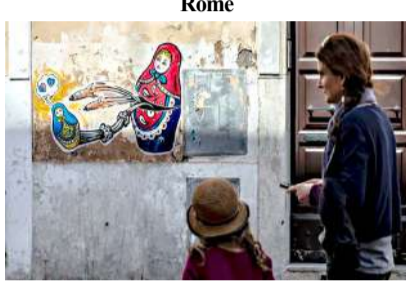
Rome Rome, the new mural by the artist Maupal against the invasion of Ukraine by Russia depicting two Matryoshkas.