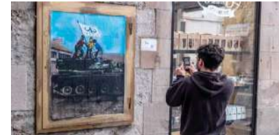
A passer-by is seen taking photos of artist TvBoy’s new collage for peace in Ukraine. TvBoy, the Italian artist living in Barcelona, installs a new collage on the war in Ukraine in Plaza de Sant Jaume, representing three children installing a flag of peace on a Russian tank.