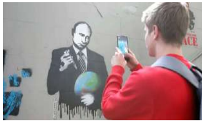
A man takes a picture of a fresco mural by French street artist Eric Ze King aka EZK displayed on “The walls of peace” on March 28, 2022 in Paris France.