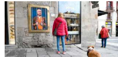
A woman looks at a new work by Italian street artist TvBoy that depicts Russian President Vladimir Putin in prison, in Barcelona on March 31, 2022.