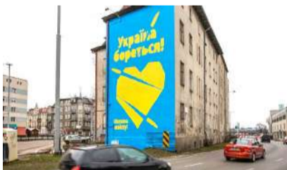
Gdansk, Poland Yellow heart pierced by bullets on a blue background with inscription in Ukrainian and Polish - “Ukraine is fighting” - is seen in Gdansk, Poland on 6 March 2022 The mural was created to support Ukrainian people during the Russian war against Ukraine.