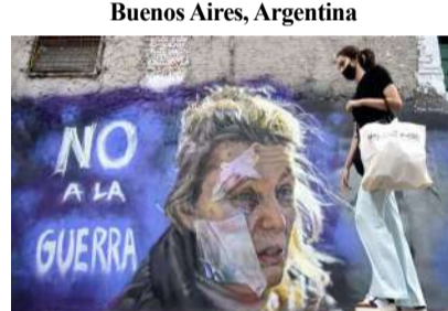
Buenos Aires, Argentina A woman walks pass the mural “No to war” by muralist Maximiliano Bagnasco in Buenos Aires on March 5, 2022.