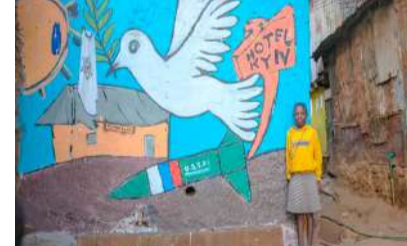
A girl poses by a street mural created by a group of Artists from Maasai Mbili depicting a sign of love from Kibera to Ukraine amidst the war.