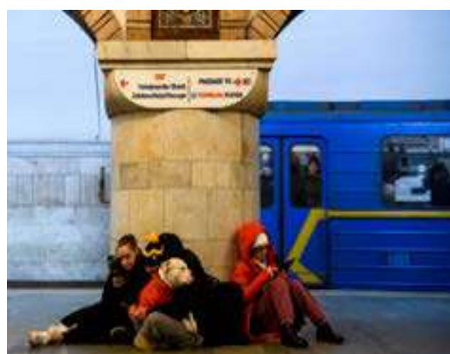
People take shelter inside a metro station during massive Russian missile attacks in Kyiv, Ukraine December 29, 2022.