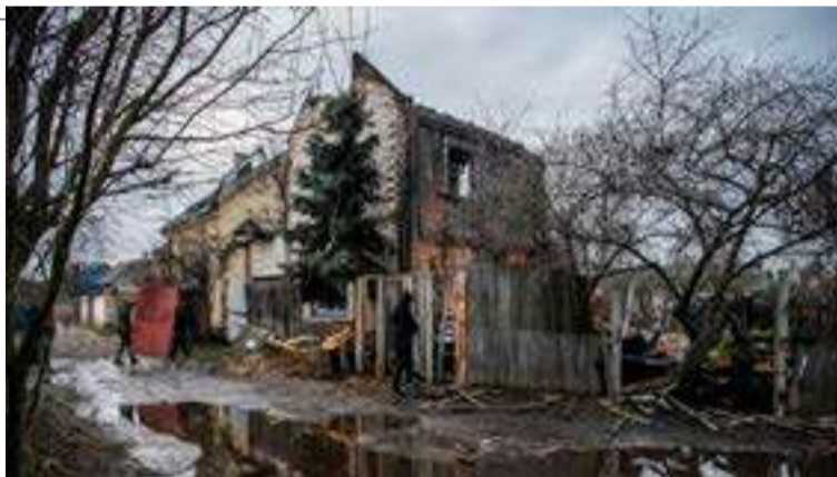
A view of a house destroyed by a Russian missile strike in Kyiv, Ukraine December 29, 2022.