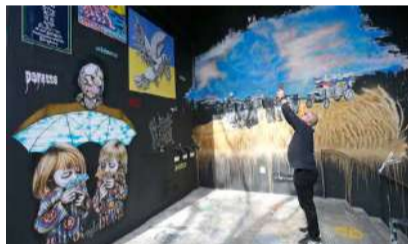
A man takes a picture of a fresco murals displayed on “The walls of peace” on March 28, 2022 in Paris France.