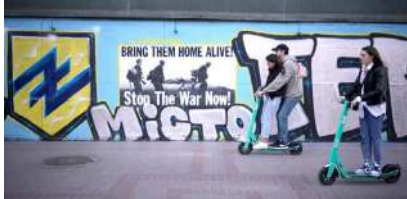
Young people ride their e-scooters past a ‘stop