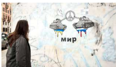
Peace. The new mural by street artist Laika dedicated to the crisis between Russia and Ukraine.