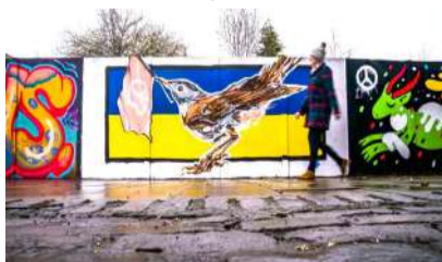
Edinburgh, Scotland New street art which has appeared in Leith, Edinburgh, in response to Russia’s invasion of Ukraine. The mural features a Nightingale, the official national bird of Ukraine, against the country’s flag. Picture date: Tuesday April 5, 2022.