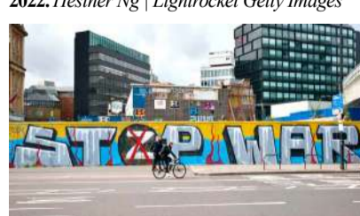
London Stop the War and the pro Russian ‘Z’ with a cross through it, solidarity with Ukraine graffiti in Shoreditch, London.