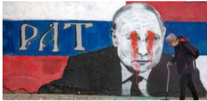
Belgrade, Serbia A person walks next to a mural of Russian President Vladimir Putin, which has been vandalised with red spray paint and the word “War” written instead of the original text reading: “Brother”, following Russia’s invasion of Ukraine, in Belgrade, Serbia, April 29, 2022.

Key Point Since Russia invaded Ukraine on Feb. 24, artists around the world have created poignant murals to support Ukraine. We share here how artists have depicted the war across the globe.