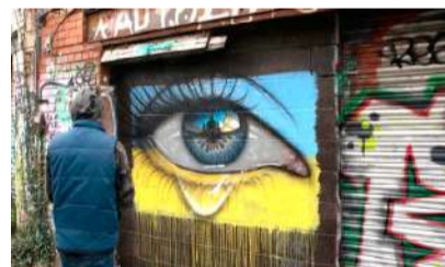
Cardiff, Wales A resident looks at new street art mural has appeared in Cardiff depicting Ukraine’s capital Kyiv under siege on March 01, 2022 in Cardiff, Wales.