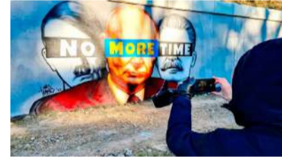
Gdansk, Poland A mural of Putin, Hitler, and Stalin with a slogan “No More Time” is seen on the wall next to the PKM Gdansk Jasien train station. (Article Continues Below)