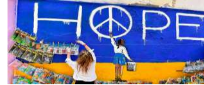
A newsagent picks up magazines next to a mural by Italian urban artist Salvatore Benintende aka “TV BOY” depicting a girl painting a peace symbol on an Ukraine’s flag, reading “Hope” in Barcelona on April 30, 2022.