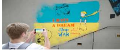
A man takes a picture of a fresco mural by French street artist Sara Chelou displayed on “The walls of peace” on March 28, 2022 in Paris France.