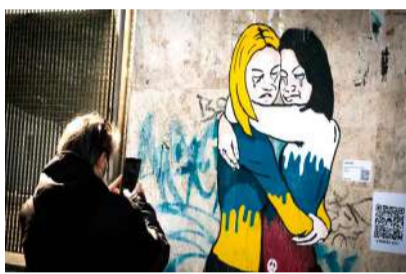
Anti-Ukraine war mural by Italian street artist known by the name of ‘Laika’ depicting a hug between two women, one dressed in the Russian, the other in the Ukrainian national colors, respectively, above the word MIR (Peace) In the Ostiense district on March 09, 2022 in Rome, Italy.