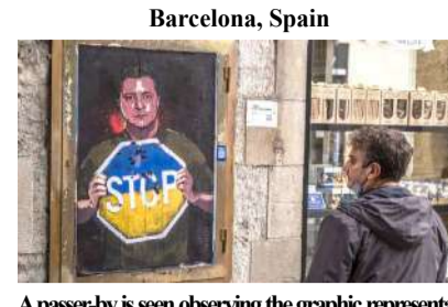
Barcelona, Spain A passer-by is seen observing the graphic representation of Ukraine’s president Zelensky calling for an end to the Russian invasion is seen in Plaza de Sant Jaume.