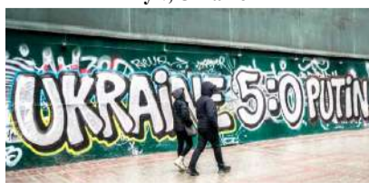
Kyiv, a mural against Putin in the city center, the inscription reads: Ukraine 5: Putin 0.