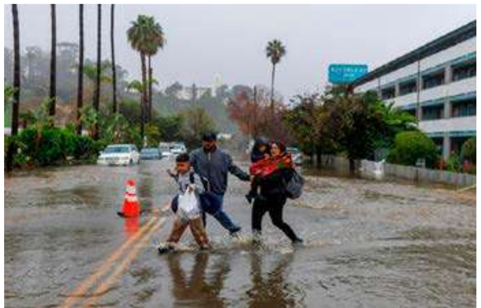
People deal with a flooded street as they check out of a hotel in San Diego, California.