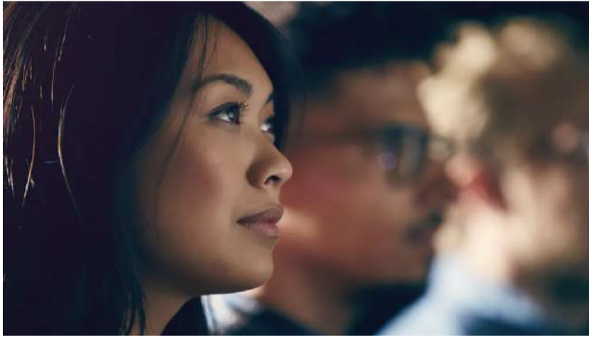
Death by suicide is the number one cause of death for young adult Asian Americans.