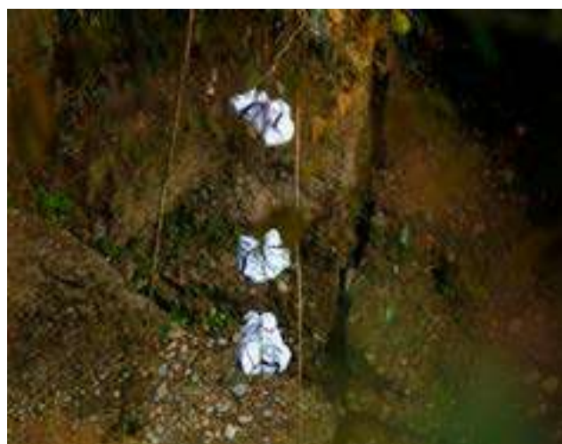
A rescue team recovers the bodies of victims from the site of the plane crash of a Yeti Airlines-operated aircraft, in Pokhara, Nepal.