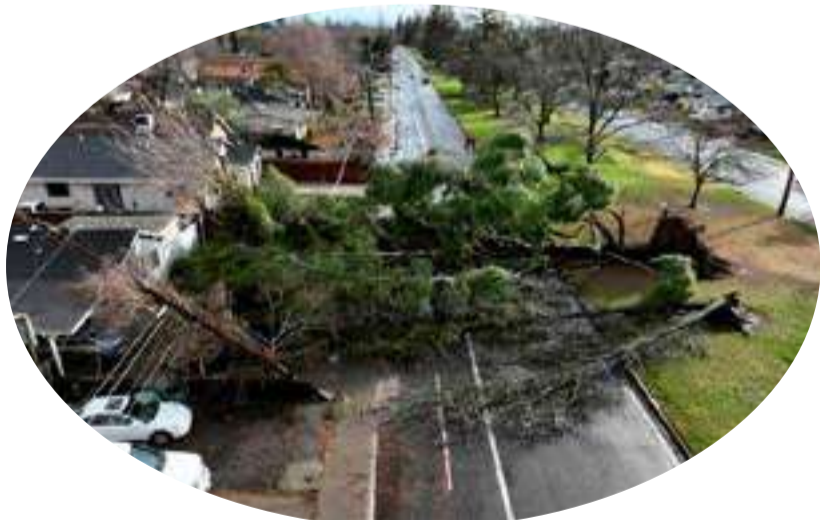
A drone view of a tree that fell during a winter storm with high winds in Sacramento, California.