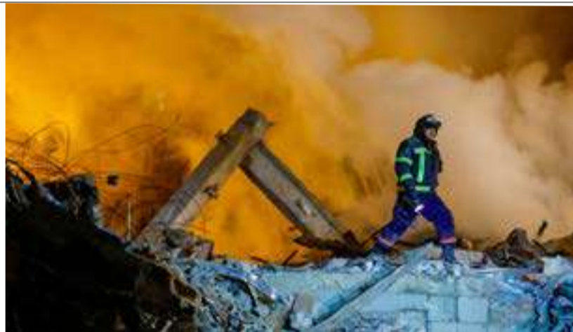
An emergency specialist walks among debris at the site where a building was heavily damaged in recent shelling in the course of Russia-Ukraine conflict in Donetsk, Russian-controlled Ukraine, January 16, 2023.