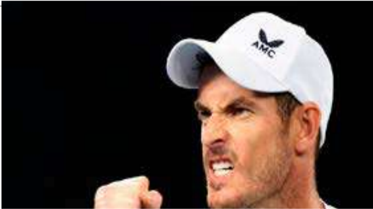
Britain's Andy Murray reacts during his first round Australian Open match against Italy's Matteo Berrettini.