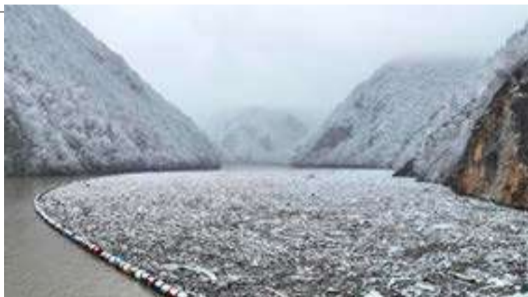
Tons of floating waste float in the Drina river near Visegrad, Bosnia and Herzegovina.