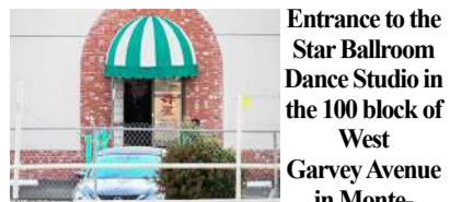
Entrance to the Star Ballroom Dance Studio in the 100 block of West Garvey Avenue in Monterey Park where the shooting took place. Multiple investigators remained on the scene throughout the morning.

The deadliest shooting in California history was in 1984 when a gunman killed 21 people at a McDonald's restaurant in San Ysidro, near San Diego. The latest violence comes two months after five people were killed at a Colorado Springs nightclub. The attack occurred at 10.22pm, roughly one hour after Chinese New Year celebrations had concluded nearby.