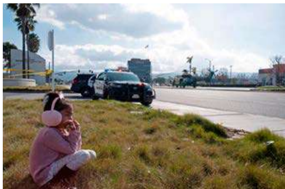
A young girl watches as police use armored vehicles to surround a white cargo van, believed by law enforcement to be connected to the Monterey Park mass shooting suspect according to an ABC affiliate, at a parking lot in Torrance, California.