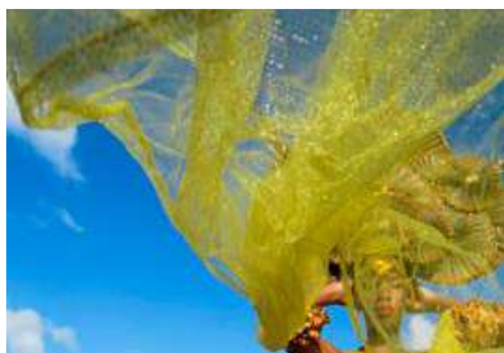
A reveler wears a local Carnival costume during the parade of "Carnaval de Sainte-Rose" in Sainte-Rose, Guadeloupe. REUTERS/Pascal Rossignol