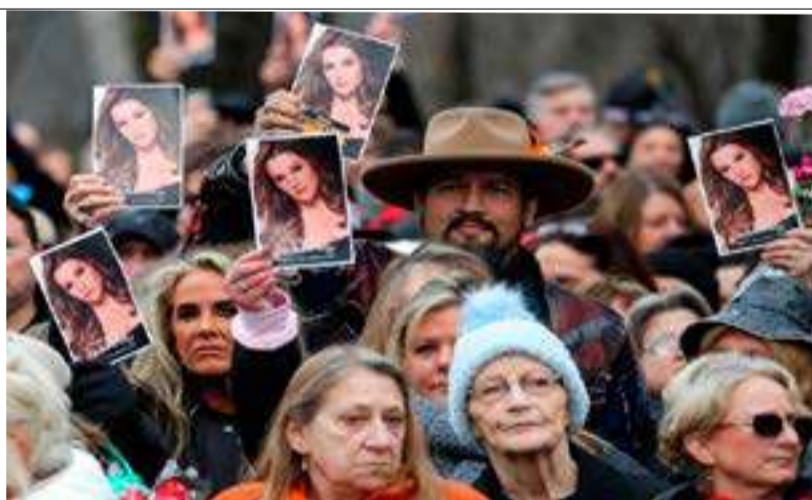
Music fans attend a public memorial for singer Lisa Marie Presley, the only daughter of the "King of Rock 'n' Roll," Elvis Presley, at Graceland Mansion in Memphis, Tennessee.