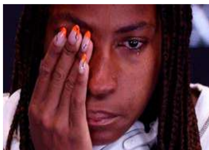
Coco Gauff of the U.S. during press conference after losing her fourth round Australian Open match against Latvia's Jelena Ostapenko.