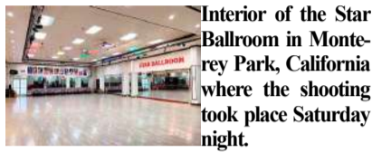
Interior of the Star Ballroom in Monterey Park, California where the shooting took place Saturday night.

'Monterey Park is home to one of the largest Asian communities in Los Angeles County and many were out celebrating the Lunar New Year.'