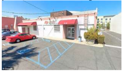
A second attack, which police were probing whether it was related, happened at nearby Lai Lai Ballroom in Alhambra (pictured)

The outgoing year of the Tiger was meant to be filled with positive and active thought, according to Chinese cosmological philosophy. But those celebrating the Year of the Rabbit suffered a rude awakening Saturday evening when the year broke out with a mass shooting.