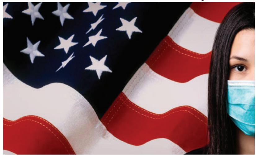
Attacks on East Asian people living in the US have shot up during the pandemic, revealing an uncomfortable truth about American identity.