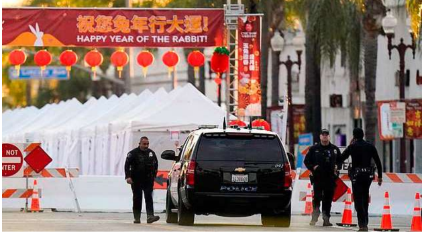
Police block off the street in front of the location of the attack in Monterey Park.