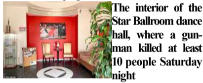
The interior of the Star Ballroom dance hall, where a gunman killed at least 10 people Saturday night

According to demographic data, Monterey Park is home to an Asian majority population. About 65 percent of community residents are Asian. California Governor Gavin Newsom wrote Sunday morning: 'Monterey Park should have had a night of joyful celebration of the Lunar New Year. Instead, they were the victims of a horrific and heartless act of gun violence. Our hearts mourn as we learn more about the devastating acts of last night. We are monitoring the situation closely. Newly elected Los Angeles Mayor Karen Bass expressed her condolences in a Sunday morning statement: 'Families deserve to celebrate the holidays in peace - mass shooting and gun violence are a plague in our communities.'