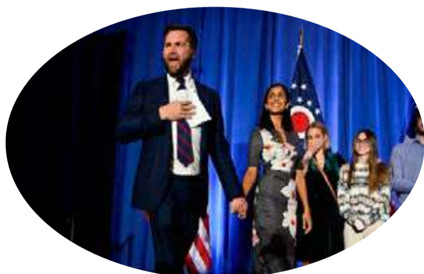
Republican Ohio U.S. Senate candidate J.D. Vance arrives with his wife Usha to declare victory at his midterm party in Columbus, Ohio.