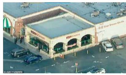
Daytime aerial view of the dance hall where 10 people were shot dead Saturday night

Ten deaths and ten injuries make the incident statistically tied as the fourth most deadly shooting in California's history. It also marks the fifth mass shooting in the U.S. this month and the deadliest since 21 people were killed in a school in Uvalde, Texas.