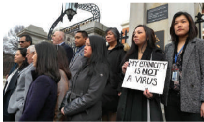
Members of the Asian American Commission gather in Massachusetts to condemn racism.