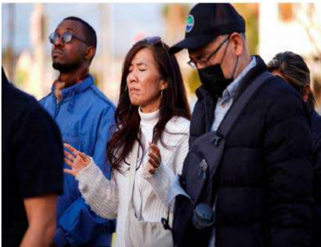
shooting that took place during a Chinese Lunar New Year celebration, in Monterey Park, California, U.S. January 22, 2023.

[1/6] A woman holds her arms up in prayer as members of the community hold a prayer vigil near the scene of a