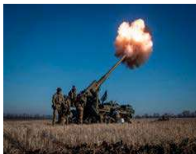
Ukrainian servicemen fire a 2S7 Pion self-propelled gun toward Russian positions, amid Russia's attack on Ukraine, on a frontline near Bakhmut in Donetsk region, Ukraine.