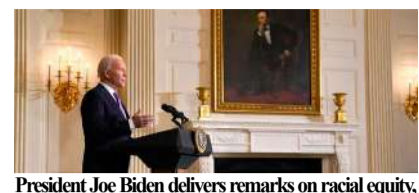
President Joe Biden delivers remarks on racial equity, in the State Dining Room of the White House, Jan. 26, 2021, in Washington, DC. | President Joe Biden delivers remarks on racial equity, in the State Dining Room of the White House, Jan. 26, 2021, in Washington, DC.

Related "It's Time To Act Now" President Biden Makes Racial Justice A Top Priority With Four Executive Orders