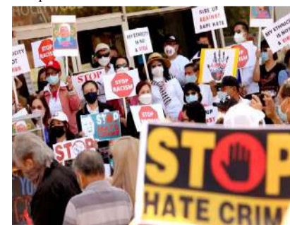
Members of the Thai-American community along with political leaders and members of law enforcement participate in a rally against Asian hate crimes in Thai Town in Los Angeles on 8 April 2021.

"Dedicate resources to local communities," wrote Stop AAPI Hate in a response to the Covid-19 Hate Crimes Act. Existing grassroots efforts that have sprung up during the pandemic offer a glimpse at what locals feel is needed: new community groups, focusing on everything from mutual aid, to activism, to organizing volunteers to patrol the streets, to stoking pride in Asian American culture, have proliferated.