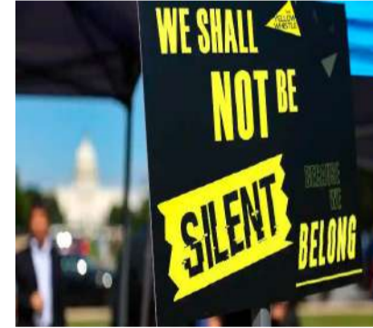
People gather at the Solidarity Against AAPI Hate rally on the National Mall in Washington DC on 31 May 2021.

ly invisible by our history books," said four NJ assembly sponsors of the bill in a joint statement. "This erasure... not only prevents students from gaining a full understanding of our nation's history, but also opens the door for racial biases that can turn into violence and hatred."