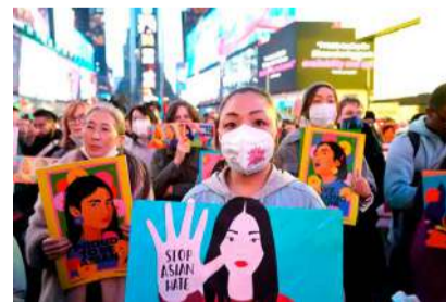
People rally calling for action and awareness on rising incidents of hate crime against Asian Americans in Times Square in New York City on 16 March.

But what's different this time, says Zia, is that more people recognize the problem. In the 1980s, Zia helped bring about the first federal civil rights case involving an Asian American: Vincent Chin, a Chinese American man was beaten to death by two white auto-workers who took him for Japanese and blamed Japan for the car industry's struggles. They were merely fined $3,000 each for the killing. Today Asian Americans, the fastest-growing racial or ethnic group in the US, are finally in a position to do more than stock up on pepper spray and hope for the best. Meanwhile, academic research on implicit and unconscious bias, improvements in data collection, and social movements like Black Lives Matter have contributed to greater understanding about racism and bias, and the ways that can translate into hate speech and violence. From the local through federal level, community advocates and other leaders have been organizing, debating, and building support, aimed at combating the ongoing epidemic of anti-Asian hate.