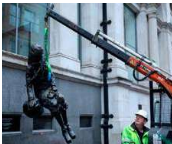
A worker uses a crane to lift a statue of Eleanor Rigby, a character immortalized in a Beatles song of the same name after it was damaged in recent cold weather in Liverpool, Britain.