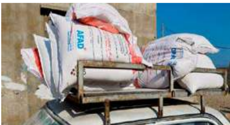
A Palestinian boy sits in a car after receiving aid at a United Nations food distribution center in Al-Shati refugee camp in Gaza City.