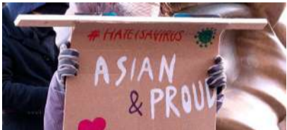
A woman holds a sign at a protest against anti-Asian discrimination.

Within these areas, TAAF seeks to build long-term solutions to defeat anti-Asian discrimination, invest in data-driven research to inform future policymaking, and create school curriculums that reflect the history of AAPI people in the US.