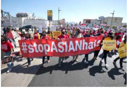
Hundreds March In Los Angeles To Protest Asian Hate And Violence Against Asians.

The initiative plans to support research to correct discriminatory practices against Asian Americans