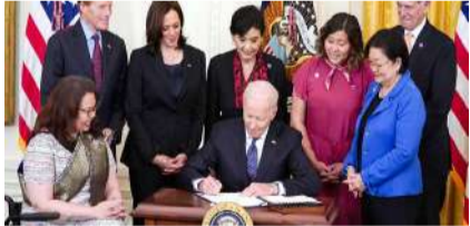
President Joe Biden signs the COVID-19 Hate Crimes Act, in the East Room of the White House, on Thursday, May 20, 2021, in Washington, DC. | President Joe Biden signs the COVID-19 Hate Crimes Act, in the East Room of the White House, on Thursday, May 20, 2021, in Washington, DC. Clockwise from left: Sen. Tammy Duckworth, R-Ill., Sen. Richard Blumenthal, D-Conn., Vice President Kamala Harris, Rep. Judy Chu, D-Calif., Rep. Grace Meng, D-N.Y., Rep. Don Beyer, D-Va., and Sen. Mazie Hirono, D-Hawaii.

President Joe Biden signed the COVID-19 Hate Crimes Act Thursday to address the nationwide surge in hate crimes against Asian Americans over the past year. The signing of the bipartisan legislation follows testimony from experts about the rise in violence and grassroots pressure to protect Asian American communities. Biden spoke about the urgency of the matter while signing the law. "All of this hate hides in plain sight," Biden said at the White House. "Too often it is met with silence — silence by the media, silence by our politics, and silence by our history." The law seeks to break that silence by improving law enforcement capabilities for dealing with hate crimes. Law enforcement agencies will receive training to better identify hate crimes, while officials will also deploy public education campaigns and create hate crime hotlines. The Justice Department will install someone to accelerate the agency's review of hate crimes. Efforts to improve data collection around hate crimes will also commence.