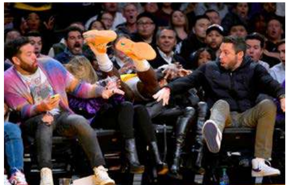
Los Angeles Lakers forward LeBron James lands on fans sitting court side as he dives after a ball in the second half of their game against the Los Angeles Clippers.