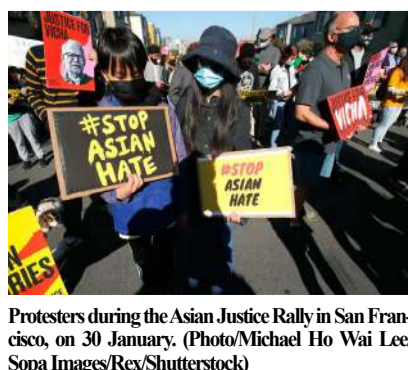
Protesters during the Asian Justice Rally in San Francisco, on 30 January.

"The fear is very real": how Asian Americans are fighting rising hate crime