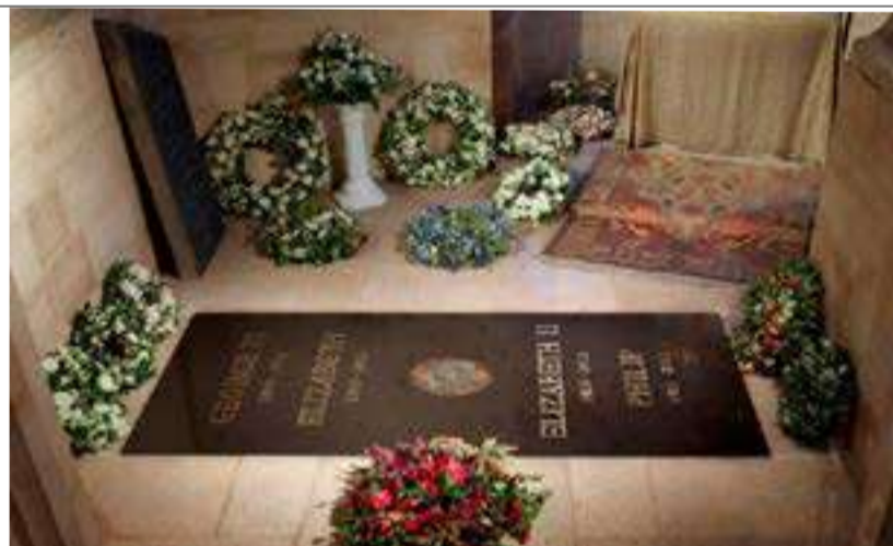
Handout photo from Buckingham Palace of the ledger stone at the King George VI Memorial Chapel, St George's Chapel, Windsor Castle, Britain in this undated handout released September 24.