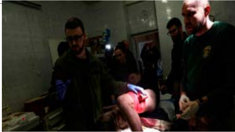
Medics from the First Volunteer Mobile Hospital unit treat soldiers transported from the frontlines, as Russia's attack on Ukraine continues, in the Donbas region of the Ukraine.