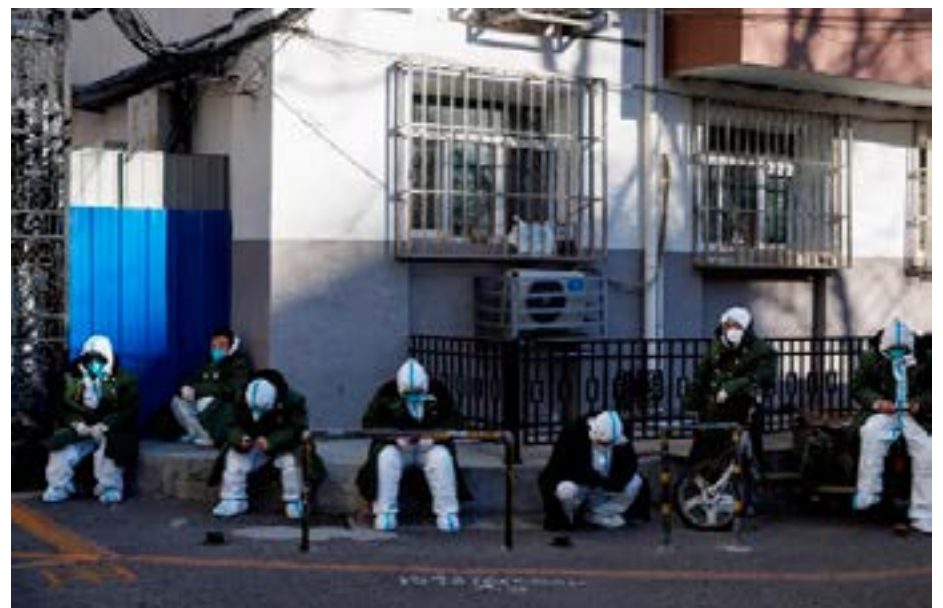
Police secures the area after 25 suspected members and supporters of a far-right group were detained during raids across Germany, in Berlin, Germany, December 7.