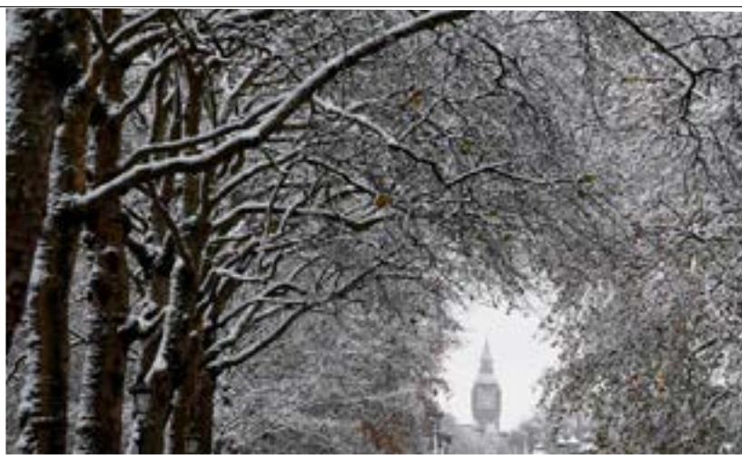
Trees are covered in snow in front of The Elizabeth Tower, more commonly known as Big Ben, as cold weather continues, in London.