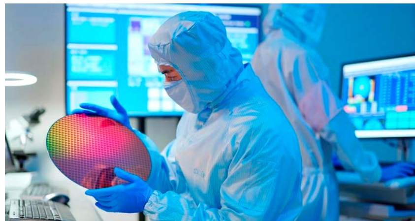
A lab technician holds a large circular disc silicon wafer that Taiwan Semiconductor will start producing in 2024 at their Arizona facility.