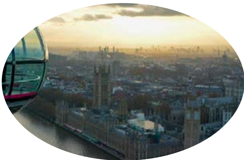
A view of the Palace of Westminster seen from the London Eye, in London, Britain.