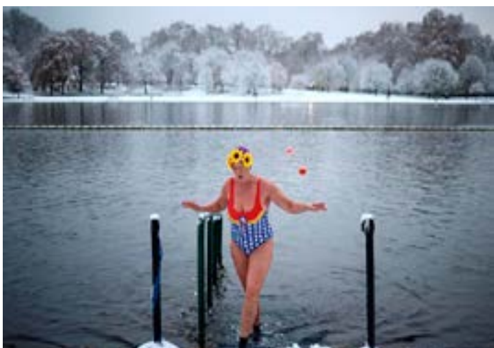
A swimmer dips her feet in Serpentine lake, as cold weather continues, in London, Britain.