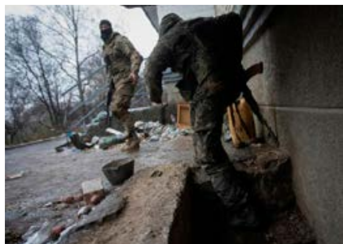
Ukrainian service members are seen in Bakhmut, as Russia's attack on Ukraine continues, in Donetsk region, Ukraine.